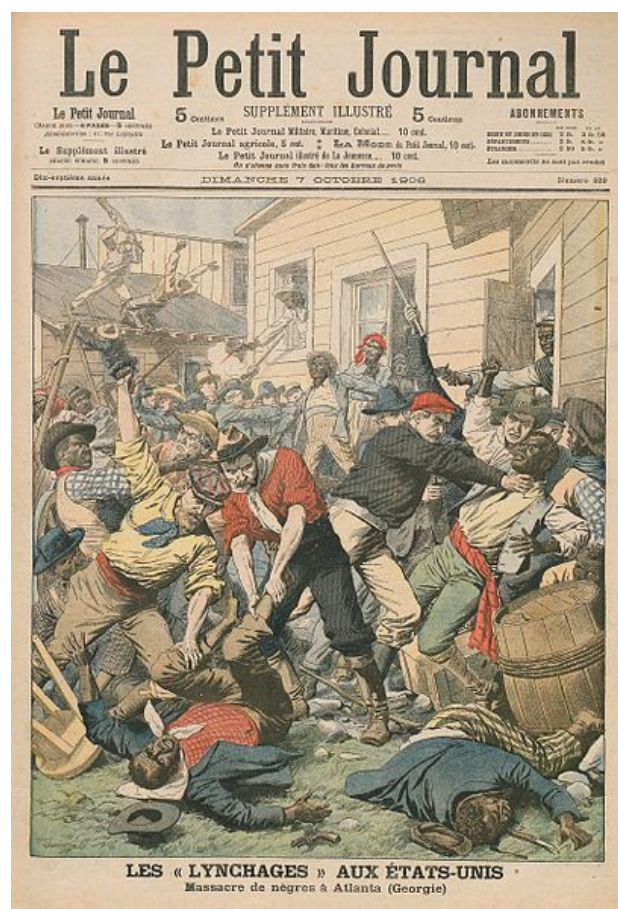
Figure 1: Illustration from the French publication, Le Petit Journal . 7 Oct. 1906. The massacre was widely reported, both in the U.S. and Europe.

The shocked but fascinated Arthur Hofman of Field’s minstrel show watched throngs of well dressed men, women and children on the sidewalks cheer and applaud mob activists beating Negroes in the streets. Frequently men left the sidewalks to join the rioters or returned from mob action to become spectators. To amuse the sidewalk galleries rioters would give a captured Negro a five yard start and then take up an armed chase with clubs and knives as the only policemen in sight energetically joined the assaults. (161)