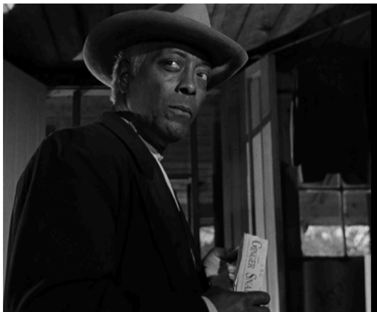
Figure 2: Juano Hernandez as Lucas Beauchamp in Clarence Brown's Intruder in the Dust . MGM, 1949. Screenshot.

to Brown's credit—and a measure of his ambivalent attitude to race—that he later admitted to Scott Eyman that he faced the shoot with some trepidation, knowing the reception that his star, Juano Hernandez, was likely to encounter: "I apologized to him in advance for the way he was going to be treated down there. I am a Southerner and I know how they treat Negroes. I told him, 'In Oxford, they're going to treat you in ways you won't like.' He told me not to worry about it, he could control himself ... He was quite a man" (23).