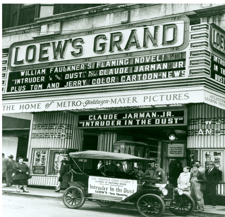
Figure 4: Photo showing how Intruder in the Dust was advertised at Loew's Grand Theater, Atlanta. Note the car heralding the film as "The South's Own Story".

In the South, MGM's promotional campaign emphasised that the film was Southern-produced, from a novel by the South's own son, William Faulkner, and featuring Tennessee-born (or raised) actors (Claude Jarman Jr. and Elizabeth Patterson) and directed by Knoxville-native, Clarence Brown.