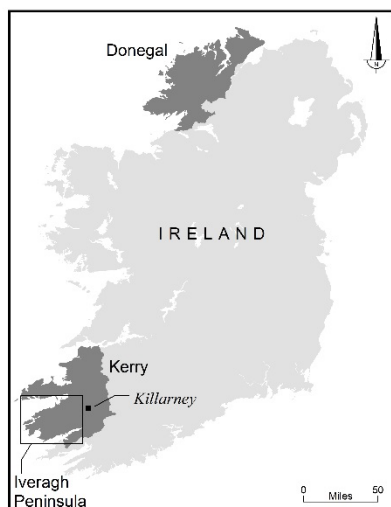
Figure 3: Location Map, showing the reintroduction site of the white-tailed sea eagles in Killarney, Co. Kerry and that of the golden eagle in Donegal. (Map produced by Mike Murphy, Cartographer in the Geography Department, University College Cork.)