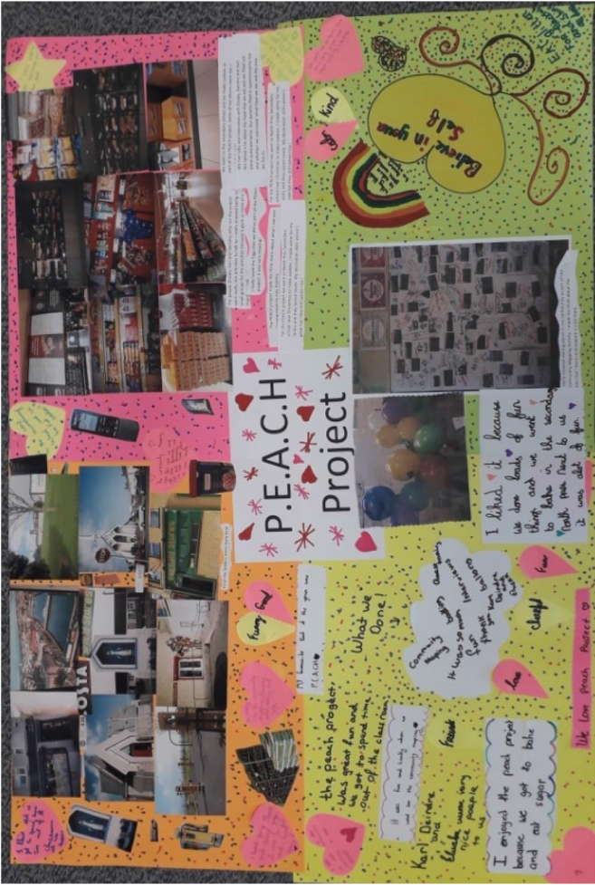
Figure 1. Collage describing the PEACH project.