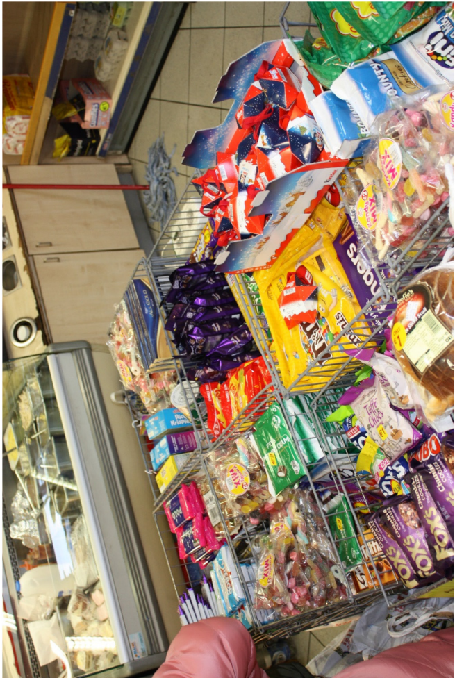
Figure 6. ‘Mike’s shop’ community walk group April 4 th 2019.