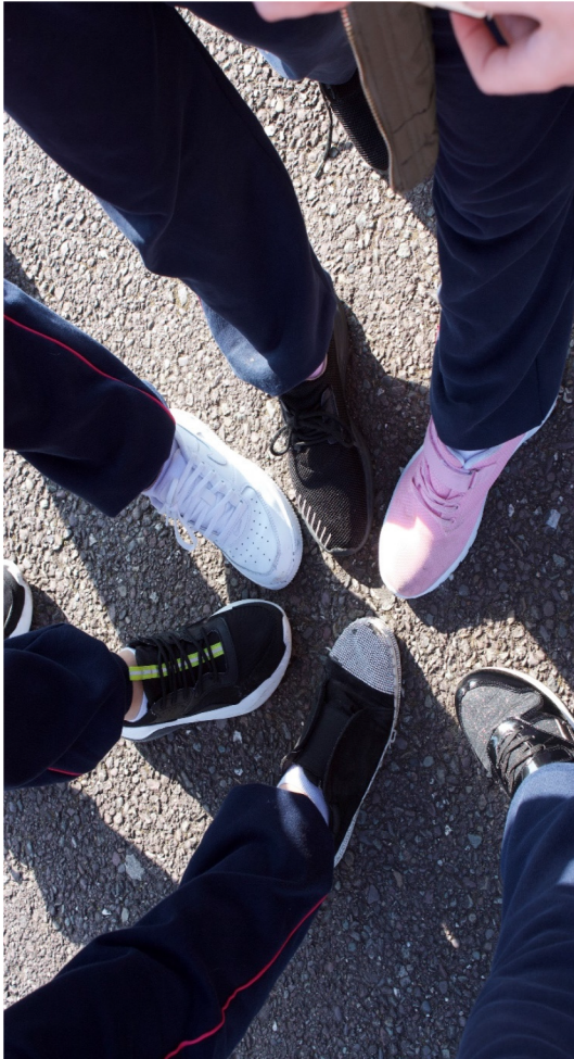
Figure 7. Photo from walking interview: One of the groups decided to mark the end of the walk with this picture (community walk group April 5th 2019).