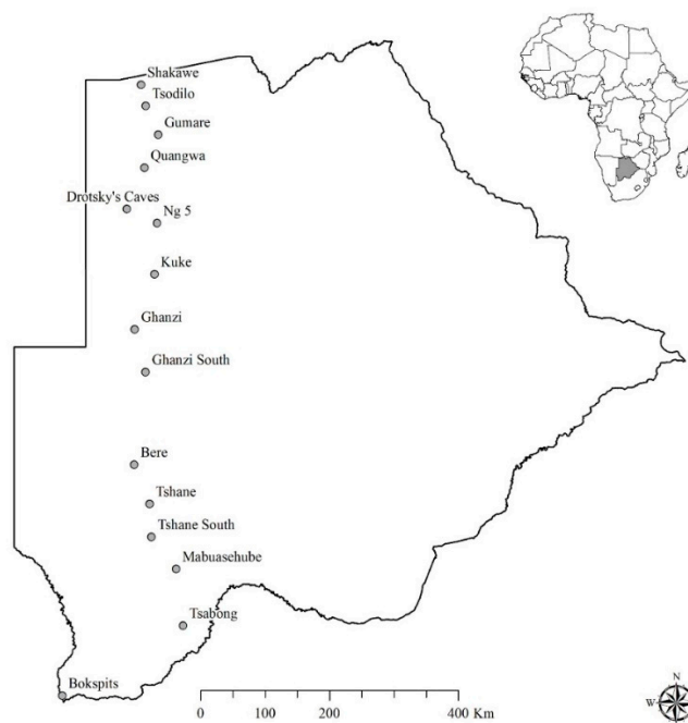
Figure 1. Location of the 15 regions along the Kalahari Transect where fieldwork was undertaken.