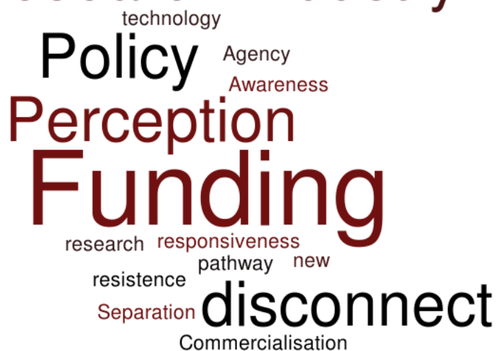
Impediments and their relevance to aspects of KET-maritime innovation

The conversations between the KETmaritime team and the stakeholders yielded a wealth of observations on various aspects of the technology transfer ecosystem between the Ket Enabling Technology sectors and the maritime sector. Participants voiced their perspectives on the opportunities they could see following a briefing on KET technologies, and proceeded to identify the barriers to uptake, and explore these barriers. These have provided the context to frame the roadmap, and the recommendations contained within.