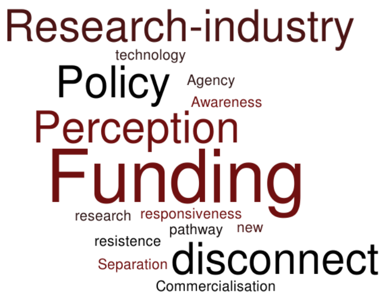
Impediments and their relevance to aspects of KET-maritime innovation

The conversations between the KETmaritime team and the stakeholders yielded a wealth of observations on various aspects of the technology transfer ecosystem between the Ket Enabling Technology sectors and the maritime sector. Participants voiced their perspectives on the opportunities they could see following a briefing on KET technologies, and proceeded to identify the barriers to uptake, and explore these barriers. These have provided the context to frame the roadmap, and the recommendations contained within.