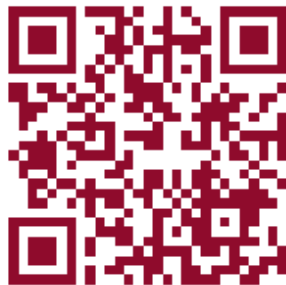
Figure 2: QR code for YouTube upload of Hito Steyerl's video performance Strike II (2012).

lack of representation of refugees drowning in the Mediterranean or those who are being held in detention centres and camps. Steyerl asserts: “If people are no longer represented politically, then maybe other forms of symbolic representation are undermined as well. If political representation becomes abstract and blurred, so might documentary representation” (2). When such dynamics take hold, it is perhaps necessary to first destroy the current image apparatus before the new, better representations can be born; something Steyerl and her daughter Esme hinted at in their video performance titled Strike II (2012):