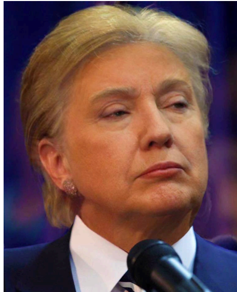
Figure 1: “Trillary”, a Photoshop mashup of Donald Trump and Hillary Clinton that surfaced on image sharing site Imgur in early 2016. Author unknown.

The beginnings of digital documentary, it should be noted, occur in the nascent days of post-Fordism—an age marked by fragmentation and pluralism, incommensurable heterogeneity, immaterial labour and an upsurge in individualist modes of thinking (Kumar 76). The wide and deep, sweeping changes have left no stone unturned, and have profoundly influenced economy, politics and industrial relations, culture and ideology. Thus, the contemporary documentary crisis is, one could argue, a mere reflection of the widespread epochal changes. The Internet, with its maze of contradictions, further added to such complexity and also deepened the representational crisis. It gave rise to a whole new world of remixes, mashups, low-resolution mobile phone videos, incriminating recordings, snapchats , selfie sticks and drone cameras; slices of reality that terrify, disturb, confuse, but also entertain, motivate, and inform. Are these the twenty-first century versions of what the Lumière brothers once called “actualities”, mere reflections of the world? Be that as it may, much of media conversations—such as the debates about the fake news phenomenon—put forward one troubling question: is this for real?