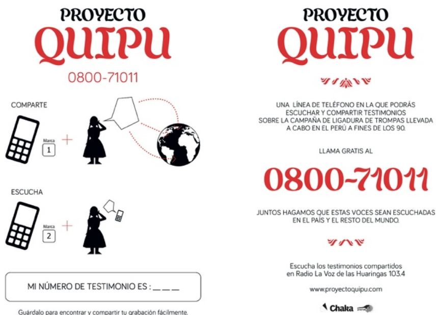
Figure 8 (above): Polyvocal database as an alternate reading of history in 18 Days in Egypt (Jigar Mehta and Yasmin Elayat, 2011). Screenshot. Figure 9 (below): An instructional brochure that was distributed to the indigenous community in the Quipu Project (2014). Screenshot from the project brochure.

Another interesting example of an archive-driven, participatory web documentary work is the Quipu Project (Maria Court and Rosemarie Lerner, 2015). It is a platform and a forum for the indigenous men and women of Peru who were subjected to forced sterilisation during the president Alberto Fujimori's rule in the 1990s. A great example of a technologically agnostic— by any media necessary (Jenkins et al.)—type of a project, it combines analogue and digital communication tools and methods in a very effective way. As there is no data service in the remote areas where most of the victims live, the creators went into the community and distributed basic mobile phone kits so