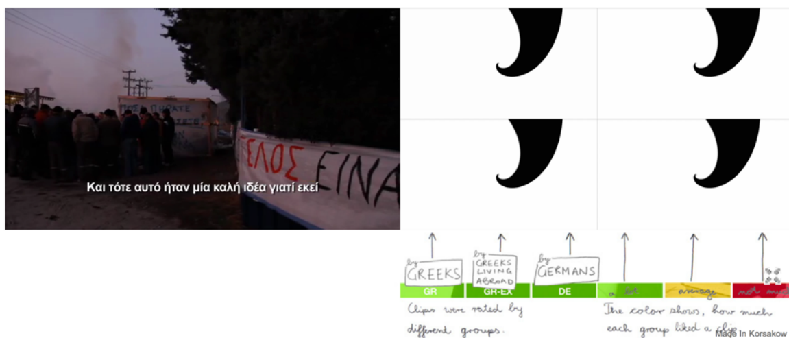
Figure 10: Interface as an experiment in democratic decision making in Money and the Greeks (Florian Thalhofer, 2013). Screenshot.

Florian Thalhofer's Money and the Greeks (2013), on the other hand, attempts to integrate the underlying principles of democracy into the production process itself. It does so by involving the audience in editorial decisions both on site and online, where they rate the material and decide what stays, what goes, and what deserves further development. Using video vignettes in a nonlinear navigation interface, and interrogating various aspects of the economic crisis in Greece, the project solicited input from three groups of participants: Greeks, Germans, and the Greeks living abroad. The resulting video tapestry is a consensus of sorts, but each clip is colour-coded to indicate how the three participating groups responded to its content (like/dislike/neutral). An experiment in collective decision making, the project allows for varied interpretations of its content. It also questions the very concept of democratic consensus, its meaning and merit in times of crisis.