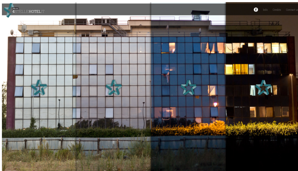
Figure 6: Navigation via four different panels, each representing one part of the day—morning, afternoon, evening, night—in 4 Stelle Hotel (Valerio Muscella and Paolo Palermo, 2014). Screenshot.

The web documentary 4 Stelle Hotel tells a story of a self-organised community of some two hundred migrant families who, in search for a shelter, occupy an abandoned luxury hotel on the outskirts of Rome. Unlike Le Grande incendie , this project avoids official interpretations of the situation at the hotel. Instead, it opts for a method that combines visual ethnography and social activism to bring the audience closer to the afflicted. A cluster of voices, varied and autonomous, map out the realities of present-day migration. User experience here is one of approximation, of “being there” and getting to know the inhabitants of an occupied hotel. Site visitors can virtually roam around the hotel and learn about the people who are part of this unique social experiment.