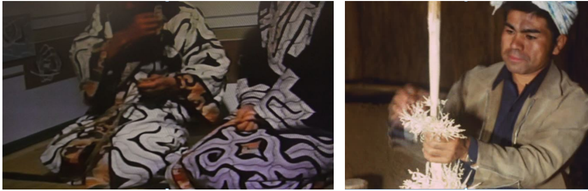
Figures 8 and 9: Ainu Wedding ( Ainu no kekkonshiki , Tadayoshi Himeda, 1971). Screenshots.

The opening sequence of Ainu Wedding presents the bride as a farmer and the groom working in his car repair shop. The subsequent scene shows their respective wedding preparations. She sews the motifs of her ruunpe (Ainu kimono made of cotton) while he carves the designs of his makiri (Ainu dagger). Both objects, representing each other's belongings ( ikoro ), are swapped in a ceremony prior to the wedding in which both families gather and drink sake together using a lacquer cup called tuki and a ritual wooden rib called ikupasui . The next sequence features the male protagonist during the decoration of their prospective chise (Ainu traditional house), the inau (sacred wood-shaving stick) arrangement and the prayers to the “guardian god of the house” ( chise kor kamuy ). Next, elderly women help the female protagonist dress up. The filming of this ritual is fascinating for the recovery of customs that Ainu women had previously kept secret and which, by the 1970s, had absolutely fallen into disuse, including the act of tying a ribbon called a raunke (also upsorokut or raunkut ) around the bride's waist as a symbol of maturity and chastity. Munro was the first foreigner who talked about this item (Munro 171–3) and its usage was even unknown to researchers from Hokkaido University who held a sample at their university museum (Hilger 155).