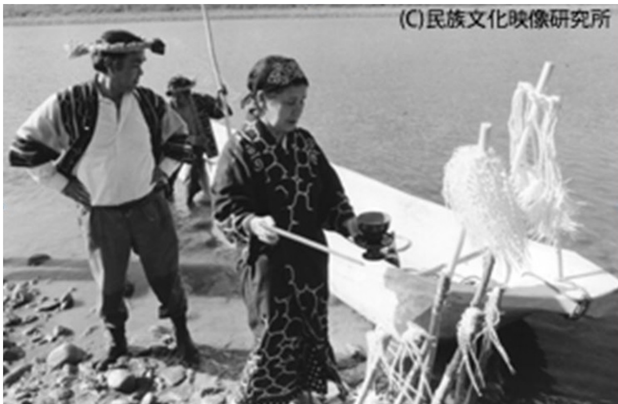
Figure 16: Ainu Canoe ( Ainu no marukibune , 1978).

The following year, Himeda directed Ainu Canoe (1978) in which he shot Kayano explaining the process of making a cip , a traditional canoe, from the selection of wood to the