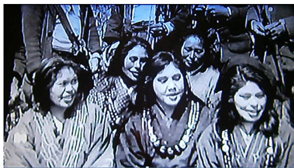
Figures 1 and 2: To the Sunny East (Prod. Nippon Yusen Kaisha, 1926). Screenshots.

Since the 1970s, the profound epistemological crisis that took place in the field of Visual Anthropology helped us to understand that ethnographic film is essentially an