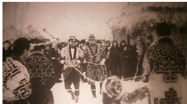
Figures 13 and 14: The Ainu Bear Festival / Divine Dispatch ( Iyomande. Kuma okuri , Neil Gordon Munro 1931). Screenshots.