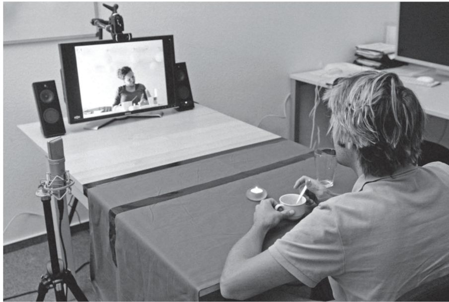
FIGURE 6 | RoomXT, advanced video communication for joint dining over a distance from Heidrich et al. (2012) (figure from Heidrich et al., 2012).

et al., 1985; Caldwell and Hibbert, 2002) and drinking (McElrea and Standing, 1992) speed (see Spence et al., 2019, for a recent review). Once again, it is a case of more research needed.