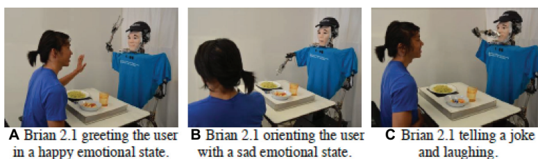
Figure 7. Example robot behaviors during a meal-eating activity.