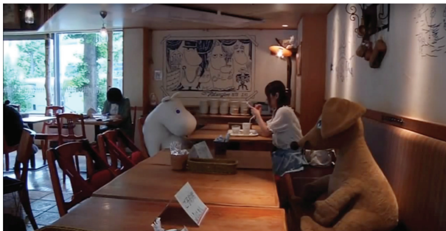
FIGURE 3 | Solo diners eating with a cuddly toy. A new trend in tackling loneliness from one Japanese restaurant (figure reprinted from Fishwick, 2014).

(e.g., Sanghani, 2014) 2 . Note that dining at Eenmaal does not seem to be about stopping by for a bite to eat, but rather actually making a statement by deliberately choosing to eat alone with other solo diners. Separately, there are also projects such as the Eden Project's Big Lunch 3 , which has been running for a few years here in the UK, with the aim being to get as many people as possible to eat with their neighbors on at least 1 day each year. At the same time, in recent years, a number of websites have emerged that help to connect diners, no matter whether or not they are solo. VizEat being one successful example of this approach (e.g., see Eleftheriou-Smith, 2017). While VizEat started out in the UK, several similar sites have since sprung up across the globe, their stated aim, to connect people whenever they happen to be, even when traveling in a foreign country, say (see Rumbelow, 2015). In North America, for instance, the equivalent site is called EatWith 4 .