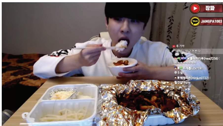
FIGURE 1 | In what sense are those who engage in Mukbang involved in a meaningfully social/connected form of dining mediated by digital technology? There are purportedly huge numbers of young Koreans (Kim, 2018; Choe, 2019; though note that Mukbang is also gaining popularity amongst other Asian and Western viewers; Donnar, 2017; Pereira et al., 2019) eating alone while tuning in to a broadcast jockey who are normally reasonably attractive individuals seen eating large amounts of energy dense food (e.g., deep fried chicken wings). This figure shows a still image taken from Korean Mukbang channels (see Vice Food, 2015).