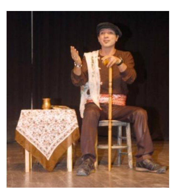
Figure 4: http://www.izafet.net/attachments/010609-3-jpg.140027/