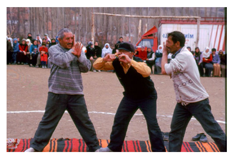
Figure 1: http://aregem.kulturturizm.gov.tr/Resim/126102,ari-oyunu-yozgat-akdagmadeni-bulgurlu-koyu.png?0