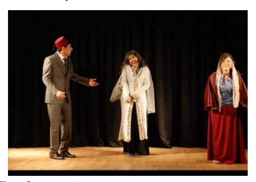
Figure 5: https://i.ytimg.com/vi/TWChPUx5cqk/hqdefault.jpg

In the Ottoman Empire, theatre in the western sense began to be performed after the Tanzimat era (Sağlam 1999). The first Turkish play "Şair Evlenmesi" (The marriage of the poet) was written by İbrahim Şinasi in 1859. It was a comedy inspired by Moliere's plays. Used to being entertained by traditional folk theatre and village shows, the Turkish people's favourite genre of western theatre was the comedy.