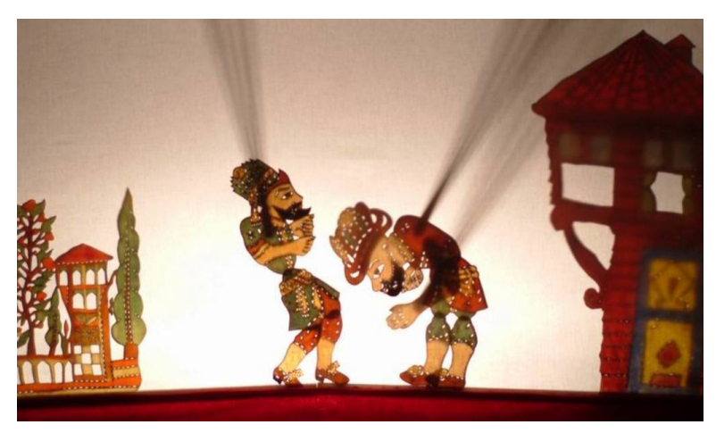
Figure 3: https://encrypted-tbn0.gstatic.com/images?q=tbn: ANd9GcQWZxqJ65p2YnxZ1Ddd5BTo2t1GQ1SFqJvb7jYaf54uNtftW91MLg

As with Ortaoyunu, one of the two main characters is educated (Hacivat) and one is uneducated (Karagöz); they maintain the comedy effect thanks to misunderstandings. It begins with an introduction where Hacivat and Karagöz meet in the street and quickly start arguing. Hacivat leaves the scene first and Karagöz follows him. The next stage is the Fasıl, or the main part of the play; it can be made up of one to three stages. The play ends with Karagöz apologizing for any mistakes, announcing the end of the play and giving information about the next play.