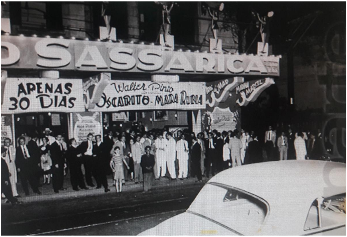
Figure 2: The facade of Recreio Theatre in Rio de Janeiro, where the revue Eu quero sassaricá ( I Want to Fool Around ) was shown between 1951 and 1952.

filled with double meanings and political satires. This mixture was especially obvious in the musical numbers. Pinto's large scale and lavish productions, as well as the interactions between highbrow and lowbrow, were a source of inspiration for the chanchadas . One of these productions was the spectacle Eu quero sassaricá which premiered in mid-1951 and starred Oscarito and Virgínia Lane, one of the most famous vedettes (beautiful actresses who tempted the male audience with scant clothing) in the theatrical revue scene (Figure 2).