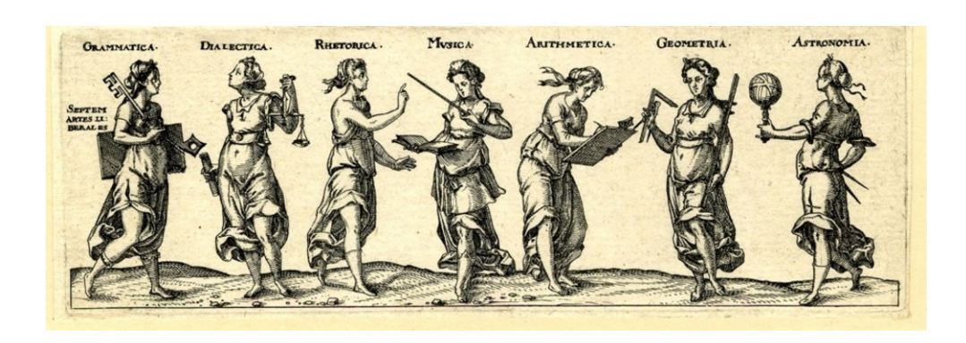
Figure 2: Septem Artes

However, what at the time was considered to constitute the 'canonical arts' underwent changes in the centuries that followed. New arts fields emerged such as music, for example, which joined other art forms to constitute the performing arts . According to Wikipedia the performing arts are commonly understood as: "forms of art in which artists use their voices, bodies or inanimate objects to convey artistic expression ...".9