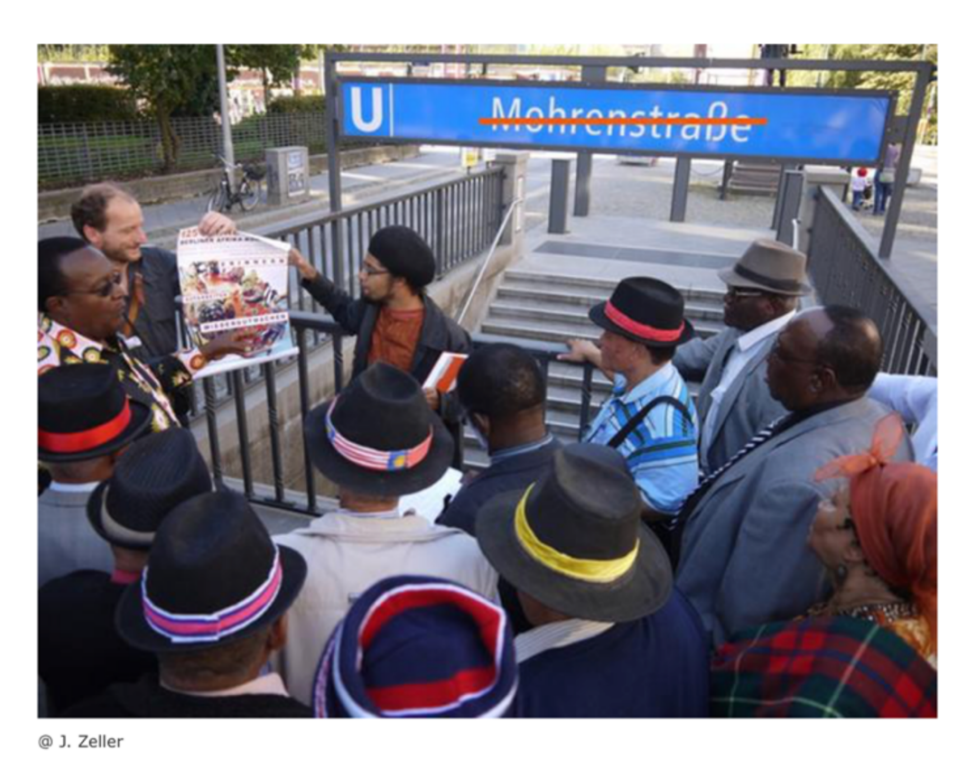
Figure 1: Underground station Mohrenstraße in Berlin

acted out and became a reference point for discussions with the audience. The integration of these short theatrical performances seems to have been the main reason for giving the city tour the label performative .<sup>3</sup>