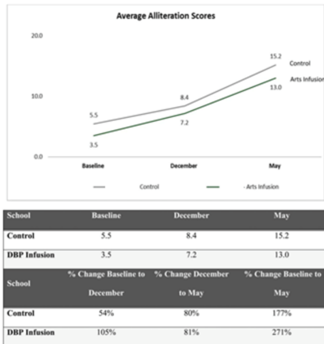
Figure 8. DBP—Alliteration. Control N = 17 , DBP Infusion N = 6 . There were no significant differences between Control and DBP Infusion Baseline, December, and May Alliteration scores. There was a significant difference between Control Baseline to December, December to May, and Baseline to December scores. There was a significant difference between DBP Infusion, December to May and Baseline to December scores, but not Baseline to December. Control and DBP Infusion analysis only include students present for Baseline, December, and May assessments.