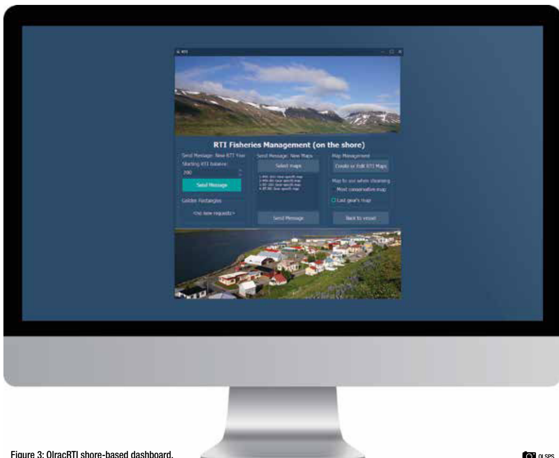
Figure 3: OlracRTI shore-based dashboard.