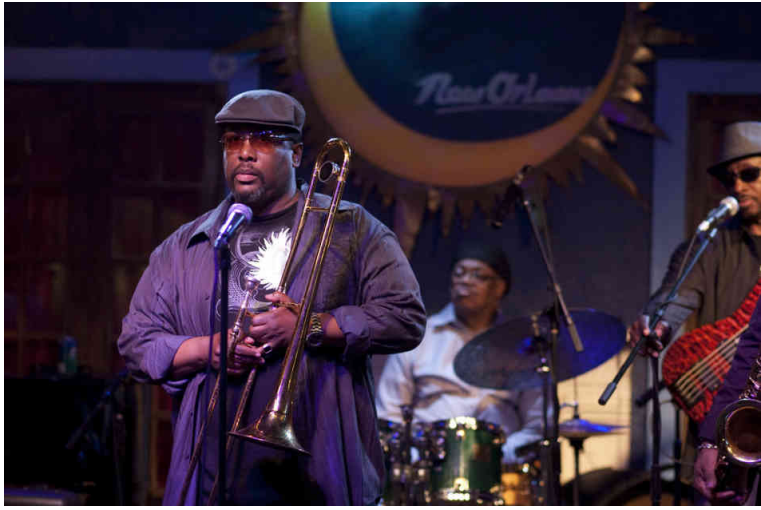
Figure 4: Music is part of the entertaining features of the series, drawing attention to local attractions—including bars and clubs used as authentic settings. Musical compositions and interpretations unify the whole series, enticing the viewer into watching the show. Treme Season 2 (David Simon and Eric Overmyer, 2011). HBO Home Video, 2012. Screenshot. DVD.

Treme crafts fiction out of the city's musical history by integrating the live performances of Trombone Shorty Andrews, pianist Tom McDermott and trumpeter Kermit Ruffins. The musical sequences provide entertaining pauses in the narrative, allowing viewers to indulge in the pleasure of watching live performances. Much of the second season enhances the entertainment objective of the series by highlighting the creativity of musical artists who channel their anger into composing new music: Antoine Batiste and DJ Davis establish their own bands whereas Annie learns how to write songs. Not only is music woven into the characters' everyday life, thus making the role of music central to the series, but it also gives sense to their remaining in New Orleans. Music is the cement that unifies the series beyond the interstices of image and sound while creating a cultural bond among the residents of Tremé, which extends to the community of viewers.