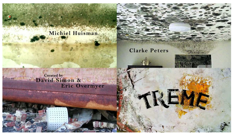
Figure 1: Photomontage illustrating the credit sequence of Treme : the camera zooms in and out of stills showing the water-lines on the mould-ravaged walls that anchor the series in post-Katrina New Orleans.

ordeal individuals went through when trapped inside their house whereas photographs of mould-ravaged walls demonstrate the lack of progress since the storm. The camera intrudes on intimate memories by focusing on personal items, thereby heralding the series' endeavours to grasp a subjective experience of life in New Orleans—instead of documenting a historical narrative.