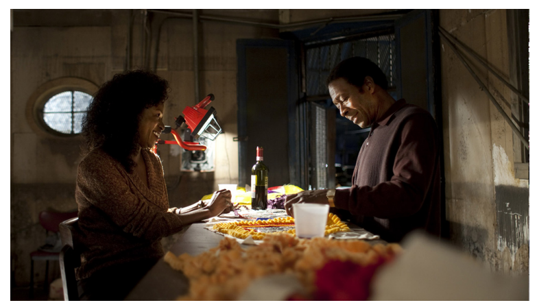
Figure 3: While Albert Lambreaux stands out as an activist fighting for housing rights, local traditions come first; his concern for sewing Indian costumes in time for Mardi Gras undermines the portrayal of his activist commitment. Treme Season 1. HBO Home Video, 2011. Screenshot.

Treme focuses on mainstream characters that made it back to New Orleans despite material inconveniences that challenge their means of survival (power cuts, water-ravaged homes, roof damage, among others). Most episodes showcase local curiosities such as clubs and streets that denote the cultural and musical backdrop of the city in which plotlines and storylines unfold. The series foregrounds local folklore when portraying Mardi Gras festivities. Although Indian Chief Albert Lambreaux spends the first parade since Katrina in jail after breaking into the housing projects, the individualistic dimension of his commitment compromises its political underpinning. Rather than extol an act of community resistance, the series underlines individual bravery insofar as his act does not support a collective agenda. Albert Lambreaux expresses more concern about the costumes he wishes to finish sewing in time for Mardi Gras to make the tradition endure than about organising his life as an activist. He fights for preserving the Indian cultural heritage of the city, but he does not strive to mobilise the community into saving the Saint Bernard housing projects.