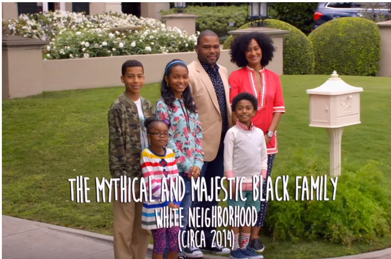
Figure 3: The Johnson family being presented as a “mythical” phenomenon in a white neighbourhood in Black-ish . ABC 2014–. Screenshot.

ABC's sitcom Fresh off the Boat , for example, interrogates the experience of a Taiwanese-American, restaurant-owning family who moved to Florida. The show aims "to reset TV's defaults" (Nussbaum) about Asian-American citizens by focusing on the increased representation of Asian Americans and their perspective on screen. Black-ish deals with the racism that African Americans are confronted with daily, regardless of their class or background. Dre Johnson (Anthony Anderson), the protagonist and father of the family, tries to make his upper-middle-class black family aware of racism and aims to increase their consciousness of race. He is worried that his children are too assimilated to white culture and that they are "aren't black enough" (Nussmann), making them forget where they come from—black urban culture. Through interracial as well as intraracial observations (Poniewozik), the show highlights the realities of the "black experience" while at the same time pointing out that there is no such thing as one unified, universal "black experience".