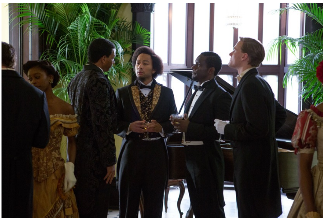
Figure 4 (above): Female-centric Underground portrays nineteenth century women fighting together against slave holders. WGN American 2016-. Figure 5 (below): Black and white Americans fighting together for the abolition of slavery in Underground . WGN American 2016-. Publicity stills.