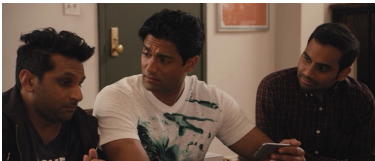
Figure 7: Issues of minority representation are challenged in Master of None . Netflix 2015–. Screenshot.