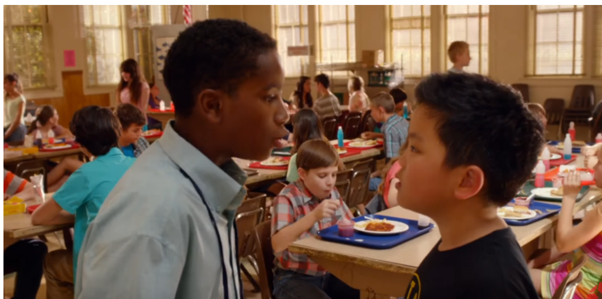
Figure 1 (above): The Huang family driving from Washington D.C. to their new home in Florida. Fresh off the Boat . ABC 2015–. Figure 2 (below): Eddie Huang (Hudson Yang), the rebellious protagonist, fighting about his culture with a peer at school. Fresh off the Boat . ABC 2015–. Screenshots.