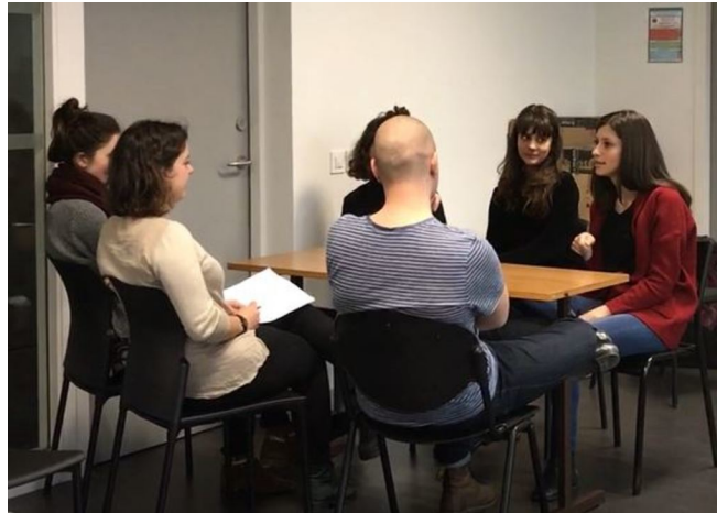
Figure 8: Hand movements