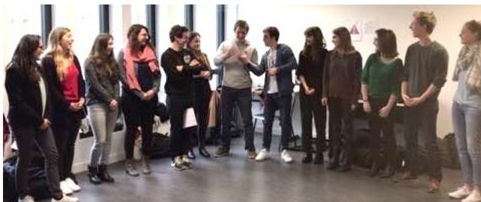
Figure 3: Passing along the product

One of the preparation phase activities requires students to think about the product they want to have advertised and hand it along from one student to the next. The product thus constantly changes aspect, weight and size, giving rise to humorous situations as can be seen in figure 3: one student makes his object turn on his finger tip, which makes other students laugh, thereby creating a relaxed atmosphere.