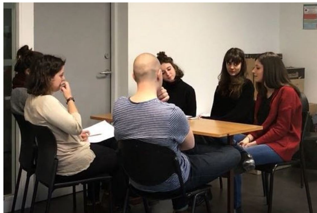
Figure 9: Carefully looking at what is said, showing interest

langues , Cormanski writes that the body has a memory relying on emotions and senses, which involves and facilitates cognition (Cormanski 1993: 315). This ensures lasting knowledge and lasting competences, echoing Varela's long-term memorization process explained before.