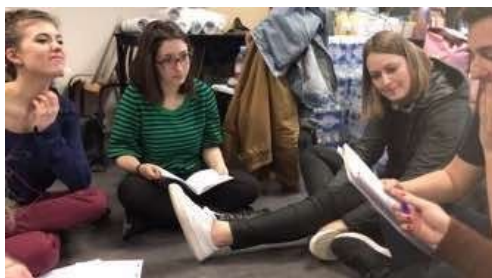
Figure 4: Preparing your bill of specifications