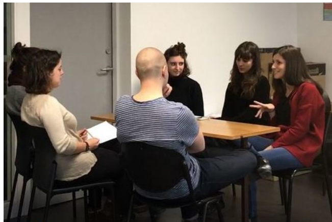
Figure 7: Hand movements