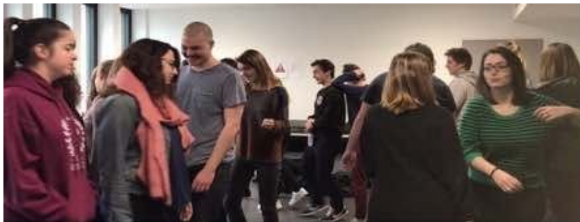
Figure 2: Walking to wake up your body

These students are used to playing roles and being put in situations of communication through drama in their English classes, so they know how important the preparation phase is. My drama classes always start with physical and vocal warm-up exercises (walking, stretching, vocalizations – Fig. 2) to engage in team building activities.