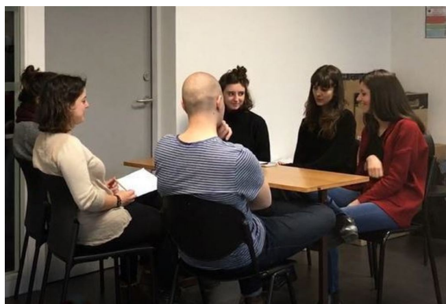
Figure 5: Presenting your advertising project