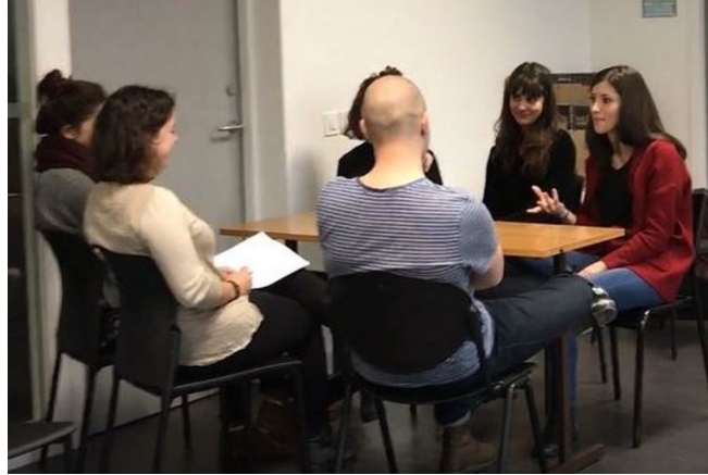
Figure 6: Hand movements

especially when she is looking for a word or trying to explain it (Fig. 6 and 7) or when she wants to insist on a concept and/or word (Fig. 8).