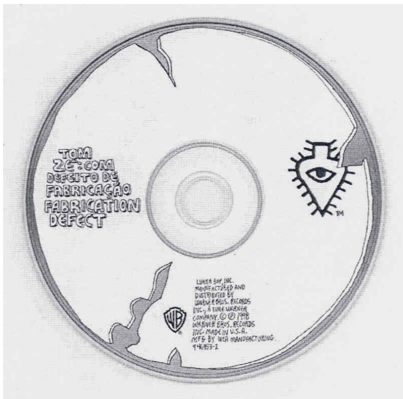
Fig. 1 – CD art on Tom Zé’s Fabrication Defect – a “defective,” cracked CD.

As we will see, from his metaphorical use of the android figure to his quasi-ironic glorification of sampling technology and electronic media, Zé has a distinctive and positive view of the subversive potentialities inherent in the overdeveloped West’s electronic technologies.