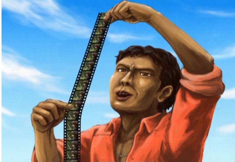
Figure 2: The archaeological discovery of film stock in the opening of Go! Go! Fushimi Jet . Go! Go! Fushimi Jet . Tokuma Japan Communications, 2003. Screenshot.

Indeed, it is clear that, in general, developments in digital technologies have provoked a reexamination of what cinema is. The threat that new media appear to pose for cinema has in various ways manifested as a nostalgic preoccupation with the mechanism of analogue cinema. 5 This sort of interest in the cinematic apparatus is especially apparent in the case of Miike's and Kurosawa's filmmaking practice in the early 2000s. Intermediality and medium awareness are critical features of these films, in which formal hybridity and play with the multiple technologies that give rise to the contemporary cinematic image emerge also in the texture of film narratives through incongruity and hybridisation. Mediality itself is in this way thematised in many of these directors' films, with the materiality of what has become an increasingly heterogeneous cinematic object making its presence felt in tangible ways. One key way that new media forms emerge in the fabric of their films is with the staging of the cinematic apparatus. As Go! Go! Fushimi Jet jettisons the idea of cinema as medially distinct from the rest of the film, locating and defining it through its contrast with animation, the staged rediscovery of cinema in these films begins with a self-reflexive foregrounding of mediality.