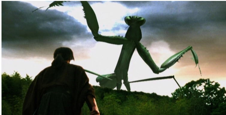
Figure 1: A CGI monster emerges in the distance behind a samurai swordfight in Go! Go! Fushimi Jet. Go! Go! Fushimi Jet (Miike Takashi, 2002). Tokuma Japan Communications, 2003. Screenshot.