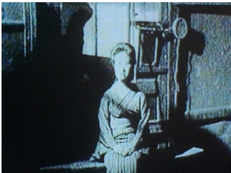
Figure 3: Cure duplicates cinema's hypnotic powers in the videocassette sequence's estrangement of the film image and repetition of basic movements and sounds. Cure (Kurosawa Kiyoshi, 1997). Homevision, 2004. Screenshot.