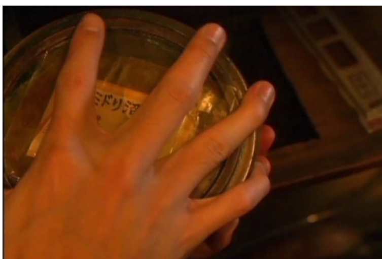
Figure 4: The conspicuous lead-in to the time-lapse film sequence in Loft . Loft (Kurosawa Kiyoshi, 2005). PMP Entertainment, 2005. Screenshot.

space between frames by disrupting the standard spatio-temporal progression of cinema—is thus embedded in a moment of media layering, in which the material basis of the cinematic medium is foregrounded. The sequence in this way becomes an overt comment on the fundamental units of cinema, as this embedded structure creates something of a mise en abyme of the interval; via this medial remove, through the context of a fragmented mediality, it refracts the film medium in order to reveal its basic structural components. Cinema’s privileged status is asserted through this deliberate mediation, such that the materiality of the image steepens the present in an irrational power that belongs to the past. Like the ancient footage in Cure and the newly discovered celluloid in both Go! Go! Fushimi Jet and Dead or Alive: Final , this weathered time-lapse footage of the Midori Swamp Mummy in Loft brackets off a display of the medium that distances it from the context of the present to infuse it with a renewed sense of immediacy, as if the past were being discovered anew.