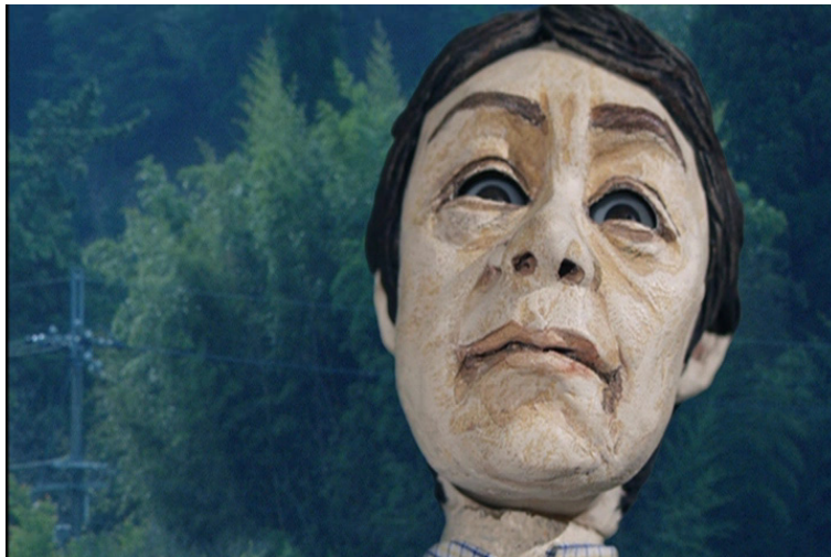
Figures 7–11: An elaborate transition into a stop-motion animated sequence in The Happiness of the Katakuris . The Happiness of the Katakuris . Eastern Star, 2003. Screenshot.

The way in which The Happiness of the Katakuris exposes the seams between contrasting media is only one instance of a broader tendency for Japanese works to flaunt the distinctiveness of their different medial registers instead of attempting to resolve them. In Mûike's filmmaking practice alone, heterogeneous visual forms and conventions of different media are juxtaposed in numerous other ways as well. The inclusion of anime's visual codes within his films from this period provides one instructive example: anime very directly intrudes on the cinematic image in the colour-block backgrounds in Big Bang Love, Juvenile A ( 46 acumen no koi , 2006); the flattened compositions in The City of Lost Souls ; the video game images, comics dialogue bubbles and graffiti-writing cut-ins in Blues Harp ( Burûsu hâpu , 1998); and the anime images and manga stills in Sukiyaki Western Django , as well as its use of the pictorial idiom of anime in the backdrop of the opening scene. This juxtaposition of different media conventions in films such as these produces an image that contains a variety of modes of spatial and temporal