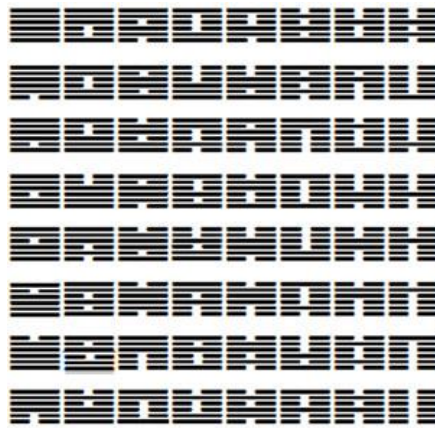
Fig. 3: (Full structure)