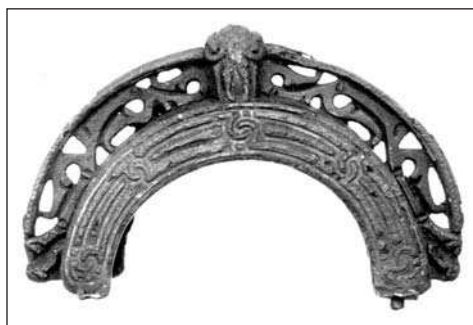
Plate 2: River Bann bell-shrine crest, back

The openwork cresting on the back, obviously, features the same running foliage design, while additional traces of gilding can be seen on it (Pl. 2). Likewise, it is also bordered on its upper edge by a band of niello inlaid with zigzagging silver wire. The back of the human head is represented and is decorated with vertical bands of niello inlaid with zigzagging silver wire, which is probably meant to represent hair. The lower section of the back is decorated with bands of inlaid silver with inlaid niello between them. The decoration forms three bands, which along their length form five evenly spaced knots. At the terminals of the lower section, at the base, there are two perforated tabs that project at right angles from the crest, with the example on the right still retaining a copper-alloy rivet. On the top part of the lower section is an inscription which is interrupted by the human head. The inscription is inlaid with niello, which would have originally contrasted against a gilded background. A few years ago Prof. Pádraig Ó Riain made a new and more accurate reading of this inscription (Ó Riain and Murray 2006, 172). This reading, with the contractions spelt out in full here, is as follows: