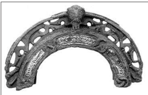
Plate 1: River Bann bell-shrine crest, front

This object represents the crest or upper portion of an early medieval Irish bell-shrine, i.e. the part which encased or replaced the handle of the enshrined bell (Pl. 1). It is semi-circular in shape and is principally made of copper alloy, having been cast using the lost wax technique. Its maximum dimensions are 89mm long, 55mm wide and 22mm in thickness. While it was cast as one piece, it can be described as consisting of two main sections, an upper and lower section. The upper section is in openwork and is the crest proper, while the lower section, which supports it, is wider and hollow. The front of the shrine fragment will be described first, followed by the back. This fragment is somewhat corroded, yet most of the original decoration remains intact.