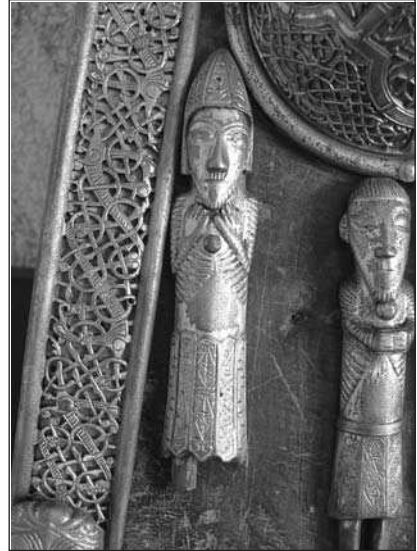
Plate 3: Figure on St Manchan’s shrine, Boher, Co. Offaly (the figure formerly in the Day collection is on the left)