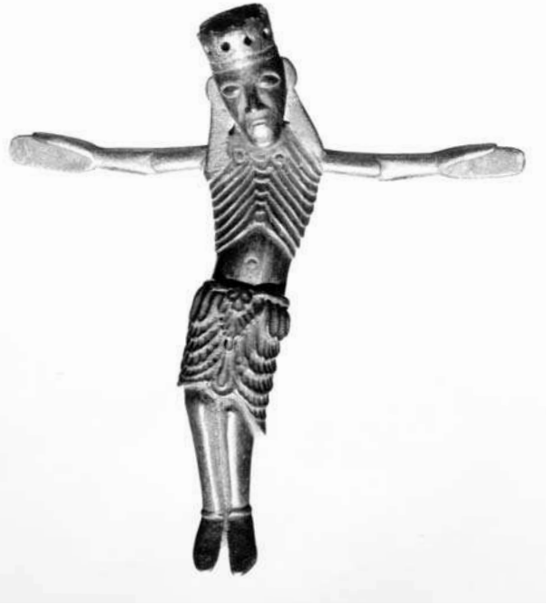
Plate 6: Crucifix figure from Co. Tyrone

while the main period of replication and copying of Irish archaeological objects was in the later nineteenth century. However, this figure never appears to have been employed, thus accounting for the unfinished state of its hands and feet, which, furthermore, have not been pierced for attachment. The Abbeyderg and county Tyrone figures feature similar faces and torsos, while the heads are similarly angled. Both also feature strands of hair that were applied separately, feet that are angled out towards the viewer, and loincloths with a central V-shaped fold. The Abbeyderg figure has been dated to between 1180 and 1200 (Hoffmann 1970, 84, cat. no. 92) and to sometime in the late twelfth or early thirteenth century (Ó Floinn 1987, 181–2; Stalley 2002). A date at the end of the twelfth century seems reasonable and is in accordance with the likely foundation date of the priory to which it belonged and which it was probably made for. Notably, considering the known provenances of surviving Romanesque crucifix figures (Ó Floinn 1987), it appears that a number of them were associated with the houses of the new monastic orders that were established in Ireland at the end of the twelfth and beginning of the thirteenth centuries.