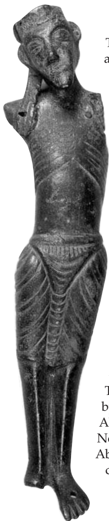
Plate 5: Crucifix figure from Abbeyderg, Co. Longford

The remaining strands of hair on the right, which has been applied as a separate piece, fall to below the shoulder. The ribs are indicated by a series of diagonal lines and are joined at the breastbone laterally by curved lines, while there is also a small depression below the neck to denote the clavicle. The navel is indicated by a small round depression. There are two rivet holes in the chest, an empty one that also pierces the remaining strands of hair and another on the other side of the chest that still contains the remains of a copper-alloy rivet. These holes are c. 2mm in diameter and were for the attachment of the now missing arms.