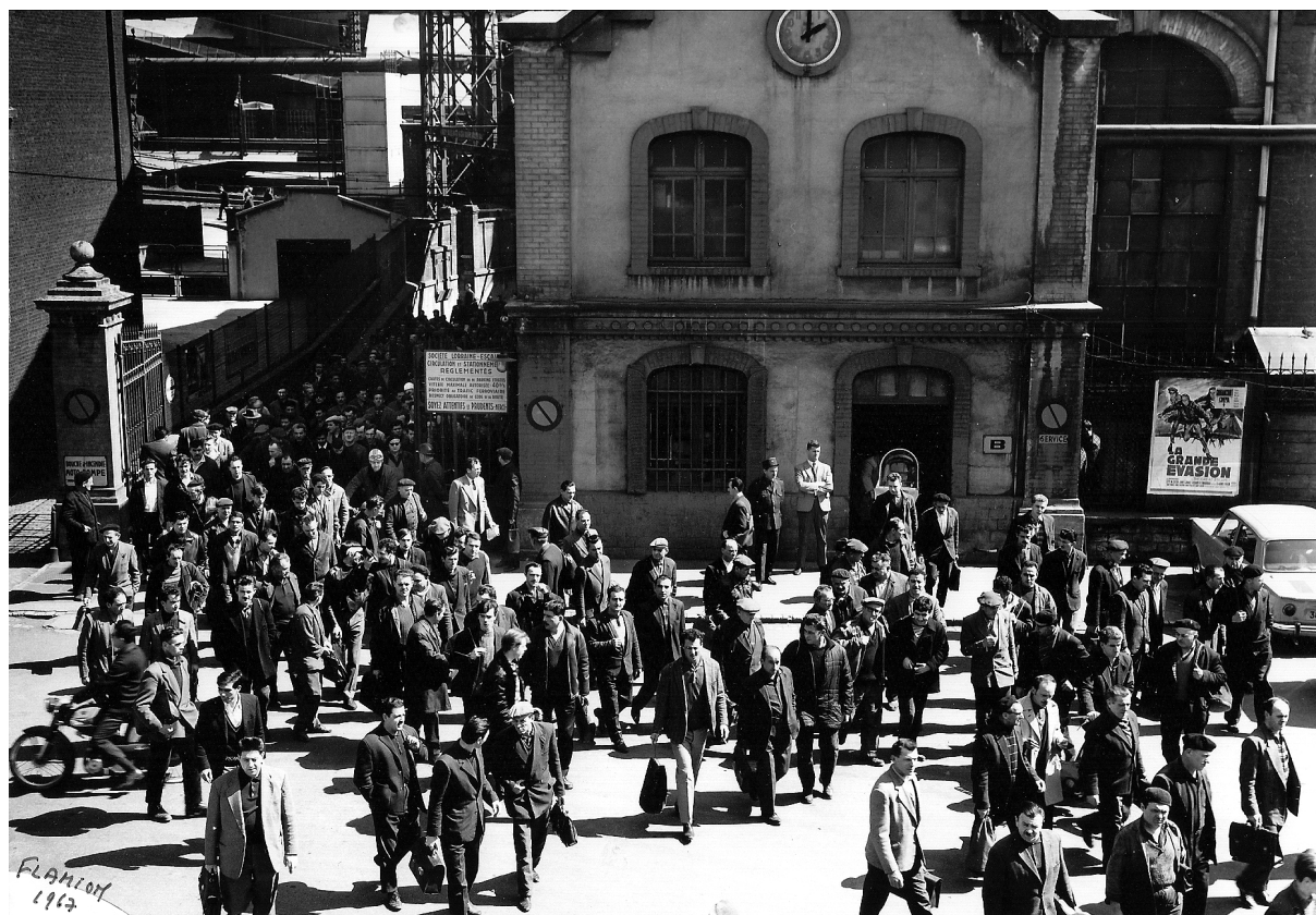
Figure 1: “La Grande évasion” (“The Great Escape”). Workers leaving the Usine de Senelle, Longwy. Photograph Bernard Flamion, Mont-Saint-Martin, 1967.

With the availability of sociodemographic data on the local population through municipal archives, the historical study of that ecosystem needed to establish the geographical location of the cinemas, to identify all the films released in Longwy during the 1950s and their box offices. A detailed analysis of the archives of the Centre national du cinéma, which centralises information from each cinema operating within French territory and their daily