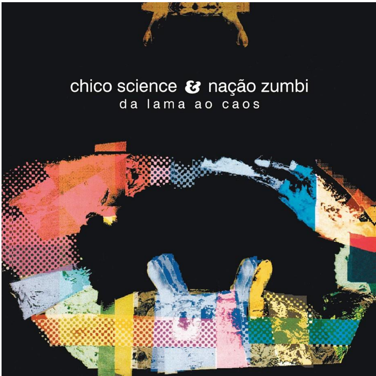
Figure 1: Da lama ao caos (From Mud to Chaos, 1994), Chico Science & Nação Zumbi's first album. Graphic design by Dolores & Morales. Inside the cover, the manifesto Caranguejos com cérebro (Crabs with Brains) was printed to spread ideas of the Mangubeat artists. Chaos, 1994.