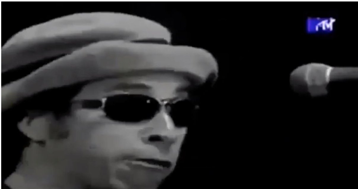
Figure 4: Chico Science in Sangue de bairro ( Neighbourhood Blood , 1997), music video by Lício Ferreira and Paulo Caldas. Saci Filmes, 1997. Screenshot.

Considering our historiographic method of approaching intermediality, studying songs also enables us to understand the films and contexts related to them. In this case, “Salustiano Song” is a tribute to Manoel Salustiano Soares (1945–2008), known as Mestre Salustiano (see Gaspar), a popular artist whose work includes ancestral rhythms, such as maracatu and cavalomarinho , among others. Mestre Salustiano became a kind of symbol for the Mangubeat and Árido Movie generation. In a documentary scene in the short Maracatu, maracatus , Mestre Salustiano makes an appearance and questions the role of marketing media in relation to popular art. He is talking about maracatu , but his criticism concerns a wider universe not only of music but also cinema. For this reason, Passages pays homage to him with the inclusion of the song “O enigma turco” (“The Turkish Puzzle”, 2002) composed by Maciel Salú (Mestre Salustiano's son) and DJ Dolores. This song comes with a sonority that refers to both the maracatu ancestral culture and the Arab music linked to Benjamin Abrahão's life.