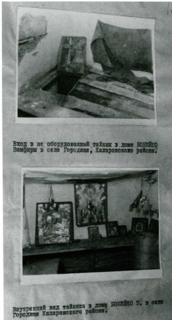
Figure 2. Photographs of an Inochentist hideout in Călărași district, Republic of Moldova (ASISRM-KGB 020193, 199).

Vera Shevzov (2007: 62) defines the Orthodox liturgy as the basis of the community's "lifeworld", highlighting its distinct role in bringing "ecclesial narratives and the Church's visual culture" together in transformative ways. In canonical Orthodoxy, the narrative performance of liturgy transforms the viewer's relationship to the icons presented during the ritual drama, giving them new meaning and power. Inochentism emerged out of this Orthodox lifeworld, but overtime it was significantly re-moulded in response to the changing social and political context. The uses and meaning of icons, and visual material culture more broadly, changed for Inochentists as they created new visual tools to animate a central narrative, which is the life, passion, death and resurrection