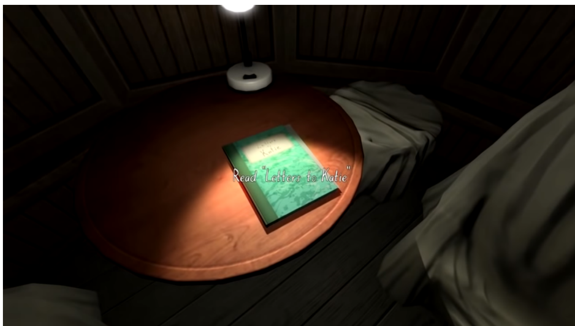
Figure 1: The closing sequence of Gone Home (2013): Sam's journal. The Fullbright Company. Screenshot.