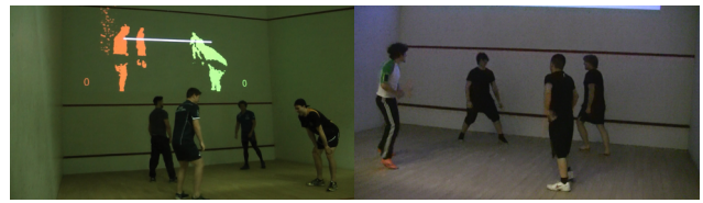
Figure 7. Self-organising at breaks in BoP and Bundle

Participants in every interview session discussed tactics used in the previous game play session and speculated on the role of teamwork in succeeding. This was particularly evidenced in the discussion of BoP, "teamwork is obviously really important like, if one of your team gets grabbed, you should grab your teammate and try and like pull him back, it's almost like, two people is better than one," "Every time we saw someone like come across, we'd both try and jump on them" "Focus on one person, get him down," "it literally takes your entire team effort to pull someone across." Participants also mentioned the importance of the social pressure in competitive team games in driving performance and endurance, "it's definitely what keeps me going in