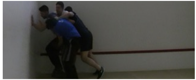
Figure 4. Players found it hard to escape the corner in Bundle

This theme describes participants' discussion of the physical space the game was played in. 59 of the total 771 units are characterized by this theme. Participants commented on the experience of playing highly physical games in a squash court that had hard concrete walls, hard wood floors and no padding. "Softer floor. It definitely needs mats I think," "Softer walls maybe as well [rubs arms], laugh." However, there weren't any feelings of danger expressed over playing in that environment, "it wasn't too bad..... I've just kind of got scuffed knees and things like that," "Just makes it more fun" "the walls didn't