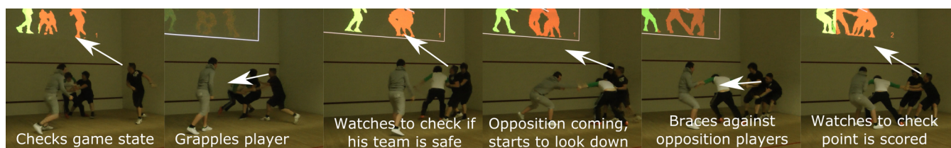
Figure 5. Arrow shows view direction over 6 seconds of BoP as the player switches between looking at screen and players.

these games was to encourage people to play physical games with each other, so the finding that players were too busy playing with each other to attend to the technology could be considered a success.