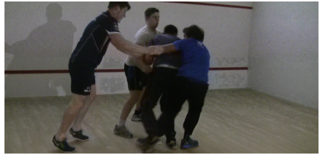
Figure 3. Attackers try to keep the 'it' player still in Bundle.

To detect how still a player is, or much they are moved by an attack, Bundle uses an accelerometer based algorithm. Because different devices (and even different phones across a single device family) have differing sensor noise levels or data rates, a custom filter algorithm is used to normalize across the phones. This first takes the raw accelerometer magnitude, median filters and high pass filters the data (both with 0.2 second time constants) to reduce sensor noise