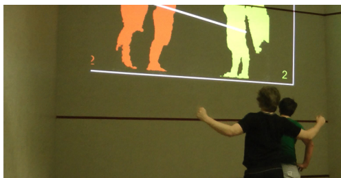
Figure 6. A player trying to make themselves as big as possible