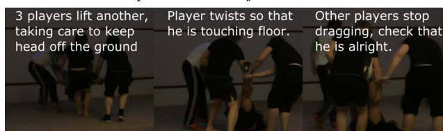
Figure 9. Player at risk, other players stop to check he is okay