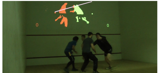
Figure 2. Players face off in Balance of Power.

Players must try and force the other team onto their side of the court. As players come over to one side, the balance tips towards that side. At random intervals of 10-30 seconds, a countdown of 5 seconds occurs. When the countdown ends, the team with the balance on their side scores a point; if the balance is in the middle, a ‘Balance of Power’ occurs, and no one scores. The first team to score 3 points wins. There is one final gameplay event, which occurs instead of a score countdown approximately 20% of the time, which is a ‘swap sides’. When a swap sides occurs, the side of the court that players ‘own’ swaps over, and they must try and get the opposing players to their new side instead.