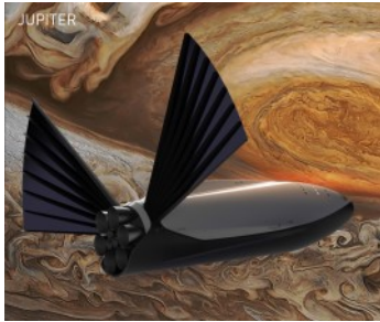
Above SpaceX's vision of reusable, cheap interstellar travel to Mars and beyond.