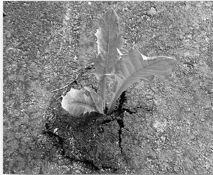
3 rd Place: “Energy of Life: Dandelion & Asphalt”

Winning entries will be exhibited at Environ 2011 colloquium in UCC in April. The winner will receive a voucher for €250 for a photography online store, kindly sponsored by the Environmental Research Institute at UCC, along with their winning entry being professionally framed and free membership to the ESAI for 2011.