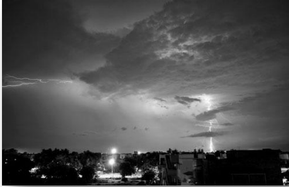
2 nd Place: “Easy Recharge”