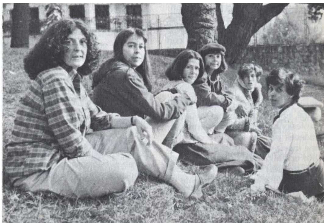
Figure 2: The women behind Cine Mujer.