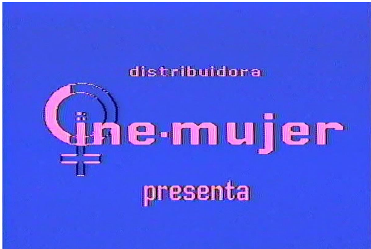
Figure 1: The logo of Cine Mujer. Screenshot.