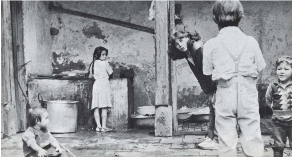
Figure 4: Clara Riascos during the shooting of La mirada de Myriam (Clara Riascos, 1987).