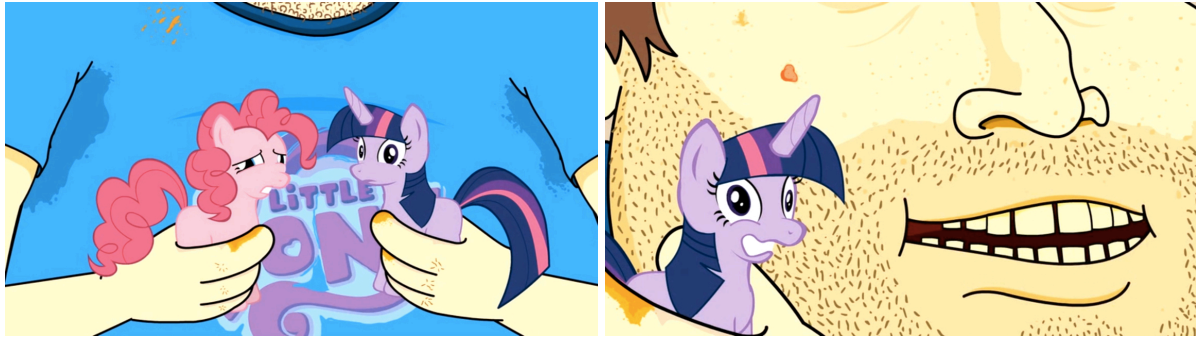
Figures 3 and 4: Pinkie Pie and Twilight Sparkle find themselves captives of a stereotypical, Cheeto-eating Brony (left); and Twilight Sparkle is the unwilling object of adult Brony affection (and unkempt stubble) (right) in the Funny Or Die parody “My Little Brony: Friendship is Tragic”. CollegeHumor , 2012. Screenshots.

And, indeed, one recurring concern that the Brony fandom constantly polices is the potential for eroticisation of children’s toys, children’s programming and, by extension, children themselves. Images of MLP:FiM blow-up dolls and plushies—some of them made by Bronies themselves as part of the creativity licensed and encouraged by this “participatory” fandom (Jenkins)—met with anxiety when publicised on the Internet. Bronies engage in a wide range of prosumer practices as they create familiar outputs such as fan fiction, artwork, music and laser light shows at Bronycon and also go farther, to “rework biblical narratives using characters and images from MLP: FiM ” (Crome 400). Bronies, like many fan communities in convergent media culture take seriously the promise of fandom as a “permanent outlet for their creative expression” (Jenkins 42).