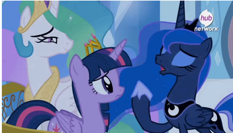
Figure 1: Alicorn Princess Luna, joined by her sister Princess Celestia, lectures unicorn pony Twilight Sparkle. “You’ll Play Your Part.” From “Twilight’s Kingdom Part 1”, My Little Pony: Friendship is Magic , Season 4 Episode 25, 2014, Hub Network. Screenshot.

unicorns, allicorns, crystal ponies and mermares. Each episode focuses on a value such as loyalty, kindness or sincerity. The programme itself may be utterly unremarkable as an anthropomorphic animation aimed at children and adults—a pink-hued SpongeBob Squarepants —but the Brony fandom and its controversy represent a situation in which “the media text to which a community might seem to be devoted ... is secondary to the communities themselves” (Driscoll and Gregg 575).