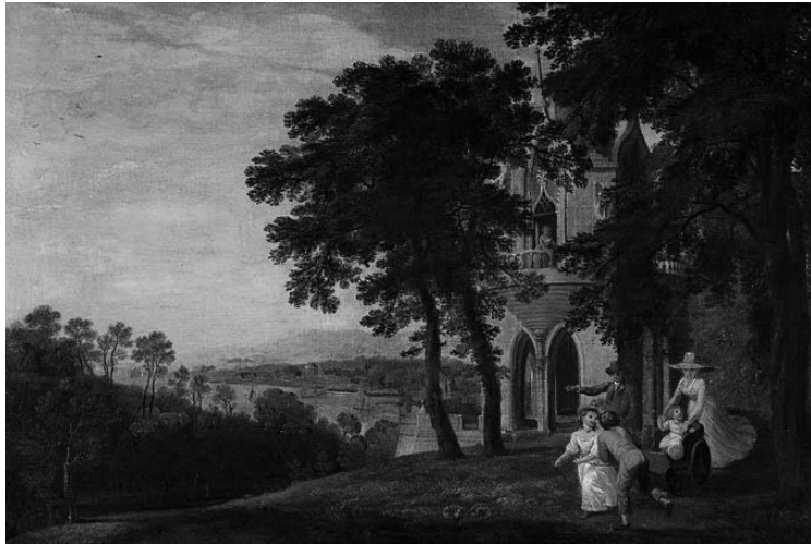
Nathaniel Grogan: Gothic Temple, Tivoli: Cork Children Playing', c 1785, reproduced with the kind permission of Dominic Daly.

The settlement of the ridges from Sundays Well in the west to Tivoli in the east first by grand houses and later by the terraces and town houses of the bourgeoisie, places a deep historical and cultural investment in elevation as a mode of living and a means of expressing social status in the city.