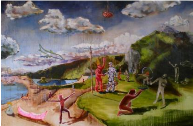
Figure 6: 'The Return of the Beothuk' (2010) by Jonathan Howse.

'The Return of the Beothuk' (figure 6, below) is part of his Return of the Native series, which includes portraits of family members. This painting is based on a nineteenth century engraving by John W. Hayward (see figure 7, below) that showed settlers bringing gifts to Beothuk, but reverses it to natives bringing gifts of traditional knowledge to settlers, turning around European patronisation. 6 When I asked Jonathan about the pale figures, he was reticent, saying that 'it's precognitive when making paintings' and 'painting is like creating new worlds' (5 July, 2013).