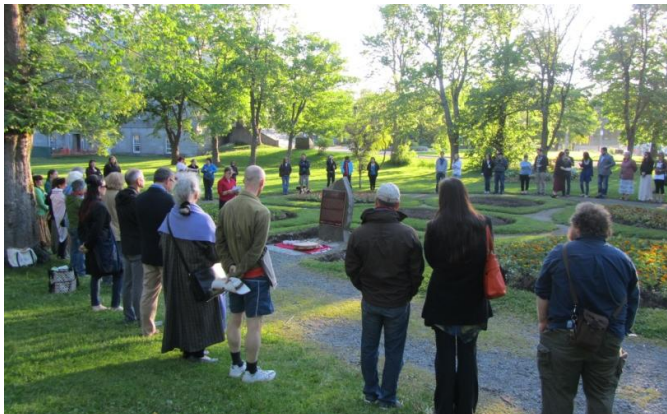
Figure 10: Sunrise ceremony at the Shanawdithit memorial plaque, Bannerman Park, St John's, 21 June 2013. just prior to the start of the ceremony.