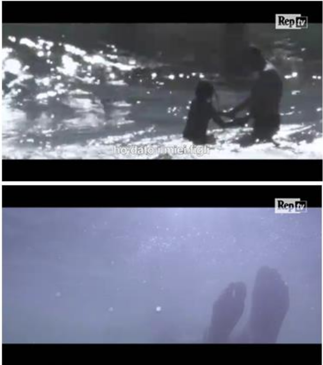
Figures 5 and 6: Un unico destino , episode 3. 42° Parallelo. Screenshots.

The second strategy for securing viewers' identification with the refugees involves the reuse of family videos. These sequences, as well as being interspersed throughout the narrative, mark the conclusion of each episode and link to the credits. Through these private images, the true dramatic power of the event unfolds, because it is wedged in-between moments of happiness and