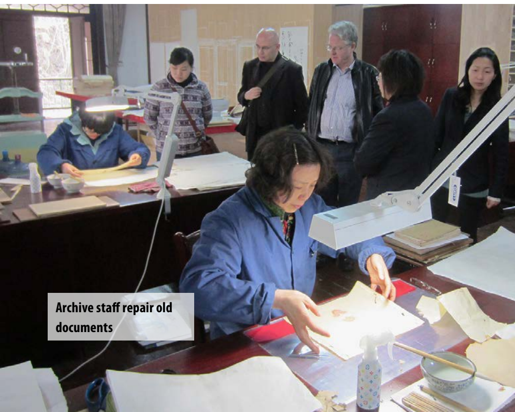
Archive staff repair old documents