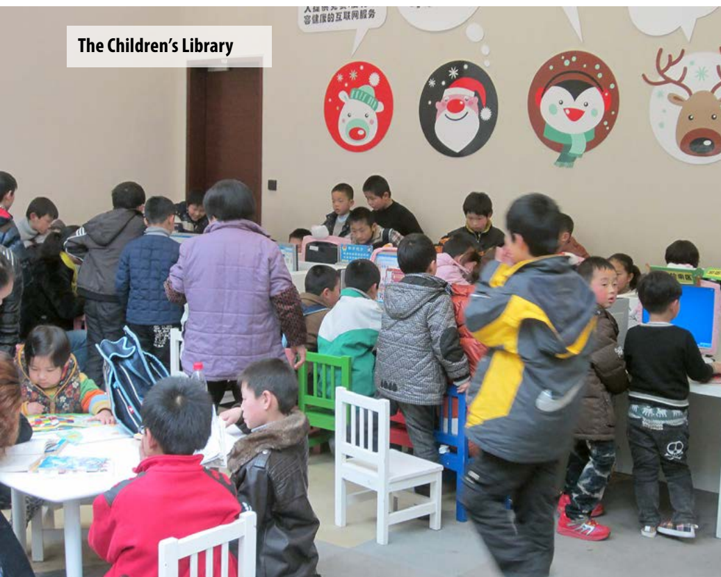
The Children's Library

and Friedrich Engels, A2 – the works of Vladimir Lenin. Further sub sections are allocated to Stalin, Mao Zedong, and Deng Xiaoping – the Chinese leader who came after Mao and who opened China up to Economic Reform. We felt it appropriate that a library Classification System for a nation espousing a Communist Ideology would place primacy on the leading thinkers of that ideology.