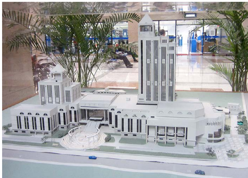
Model of Shanghai Public Library

We travelled to Shanghai for a weekend and visited the Shanghai Public Library which is the tallest library in the world. One very interesting feature we noted in Shanghai library is the way that you request a book. You do not