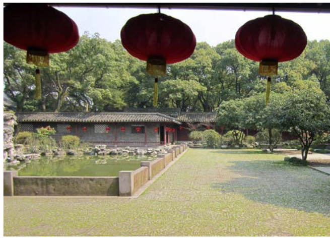
Tianyi Pavilion Library, the oldest private library in Asia and third oldest in the world