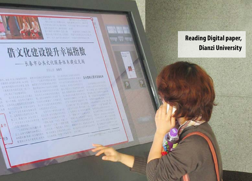
Reading Digital paper, Dianzi University