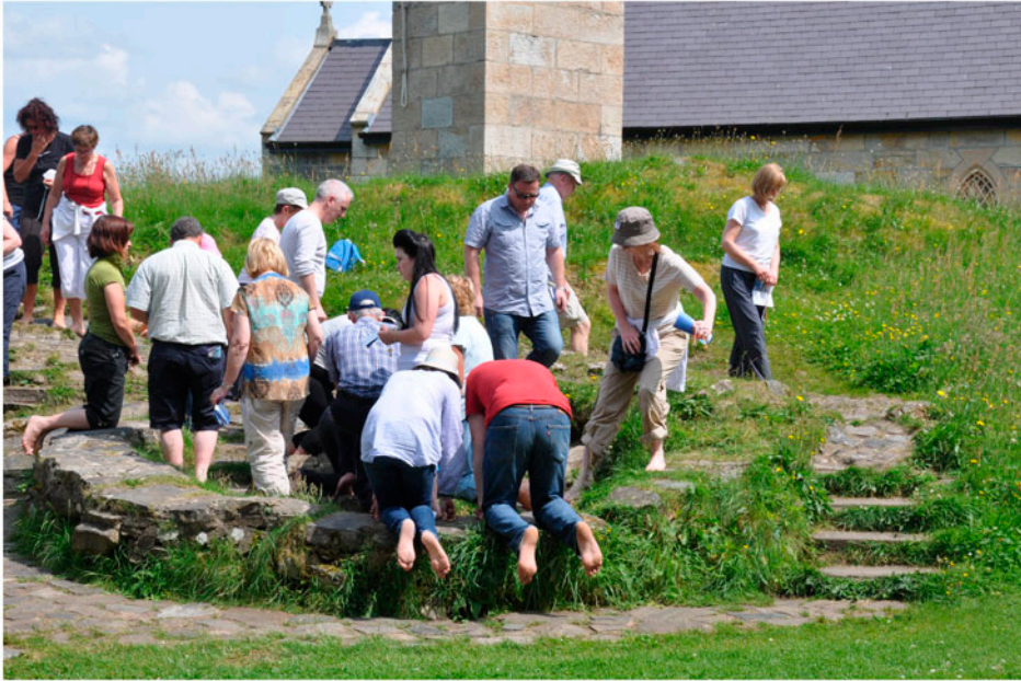
Figure 1. Pilgrims at penitential 'beds' at Lough Derg.

emphasis that is placed on the role of the practices and the performing body throughout the services, sermons and reflections.