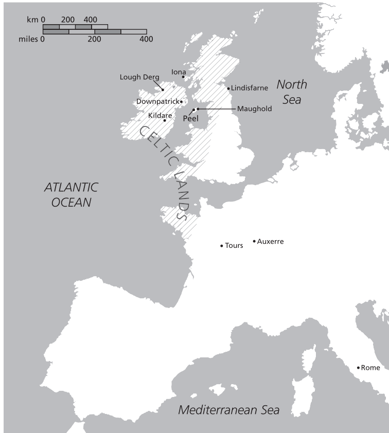
Map 1. The Celtic region in the early medieval period.

expressions of faith. Secondly, pilgrimage can be seen as part of changing spatial practices, including ‘taking the church out of doors’ in the face of declining regular attendance at church (Maddrell, 2011, 2013).