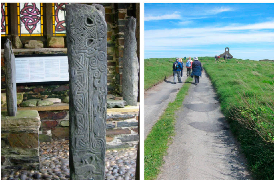
Figure 2. Manx cross, Kirk Maughold and Praying the Keeills prayer walk to St Michael's keeill 2014.