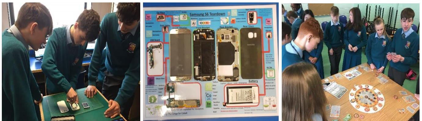
Figure 2 Sample of Photos from Project Activities

A google classroom for the teacher design and delivery teams was set up to share all resources and also to ensure good communication and sharing of ideas, progress and indeed challenges before, during and after delivery. The unit was delivered over a 4-week period and teachers were encouraged to complete a learning log at the end of each week. This ensured that classroom activities and strategies that worked well were logged and also connections that students made between learning each of the subject areas was identified. These reflections would form the basis of the evaluation of the unit at the end of delivery.