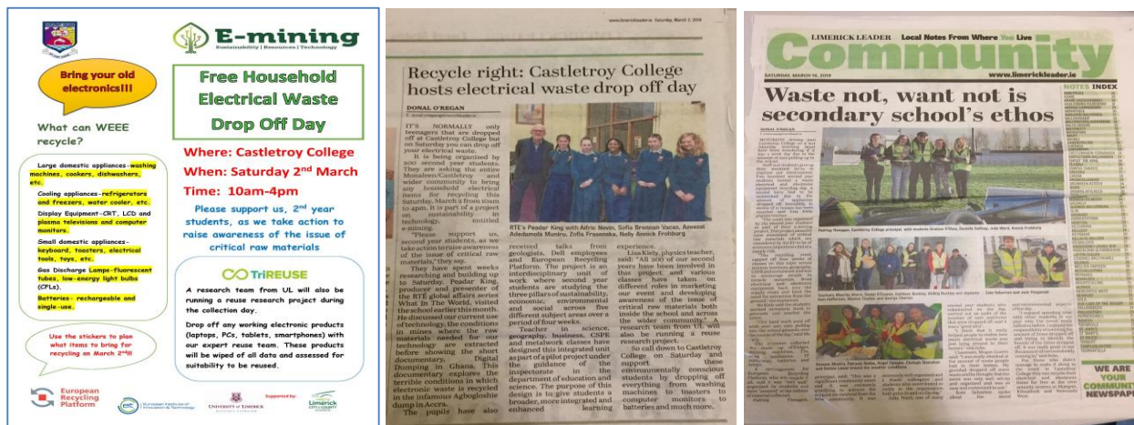
Figure 3 Selection of Photo's from WEEE Collection Event

A group of students from the 2 nd year cohort formed a core organising team and worked hard marketing and planning the WEEE collection event which was held in the school grounds a few weeks after delivery ended. The event was a huge success with 11 tonnes of electronic waste dropped off for recycling on the day. Students turned up on the day and carried out a range of jobs such as logging number of cars as well as keeping an inventory the various items that were being dropped for recycling. Students exhibited great interest and enthusiasm and were hugely proud of their efforts in collecting so much WEEE for recycling.