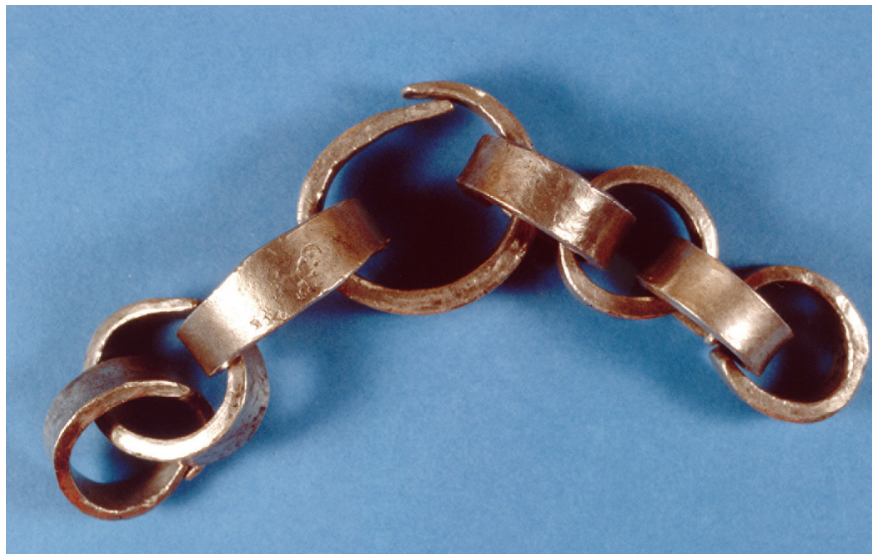
Fig. 1. 'Bullion-rings' from the 'Ireland no. 2' hoard.