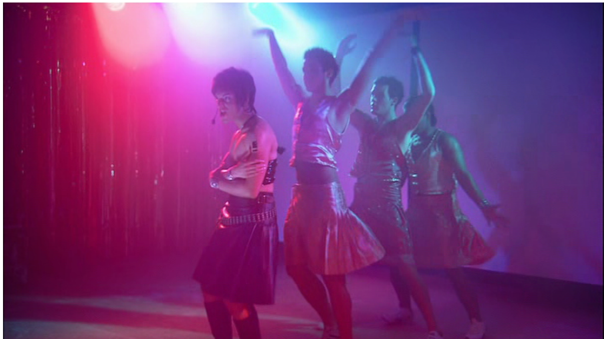
Figure 3: The Chutney Queens performing drag on many levels. Nina's Heavenly Delights . Kali Films, 2006. Screenshot.

performance they wear kilts made out of either Indian material or, in Bobbi's case, leather (Figure 3). At the film's end, they all perform in traditional Indian garments against a Highland backdrop. The Chutney Queens therefore offer a striking hybrid of not only Indian and Scottish culture, but also drag culture, tying racial, national and gender identities together. However, Churnjeet Mahn argues "that the mobilization of stereotypes about Scotland and a vision of Scottish national identity is used to erase the traces of friction between traditional, or normative, and non-normative sexualities" (326). For Mahn, although Nina's Heavenly Delights 's inclusivity glosses over the potential disruptiveness of Nina's sexuality (324), the film ultimately "lay[s] foundations for a productive subject identity that marks the film out against the prevailing trends in contemporary films and critical discussions of female same-sex desire in the South Asian diaspora" (326).