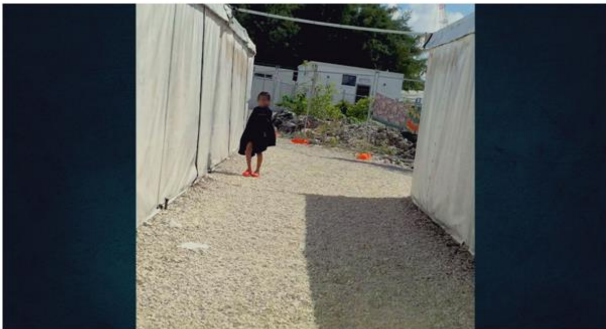
Figure 1: Blurred shot of a child in the camp. Chasing Asylum (Eva Orner, 2014). Nerdy Girl Films, 2014. Courtesy of Eva Orner. Screenshot.

Orner's deteriorating health revealed something more than an acting out of the suffering she had witnessed in the island detention centres and the stress of managing the clandestine filming. It also embodied a post-memory syndrome in relation to her parents. Somatically rather than metaphorically, she was bearing the weight of accumulated suffering on her shoulders. In writing about the film, Orner takes on the burden of the refugee, although, despite her fierce independence and obvious competence, this entails a counter-intuitive retreat into a childlike dependency on others. She manifests that dependency as she becomes sicker and more in need of professional assistance. When she talks about going home, her tone is apologetic and she appears to feel guilty that she has not managed to include "India, Burma, and Israel" in her punishing schedule. Even though no child's voice is heard in Chasing Asylum , the filmmaker speaks for her own child-self. It is as if she too were a refugee, away from home, and, at the same time, a child who is failing in some unspoken chiasmic obligation to others.