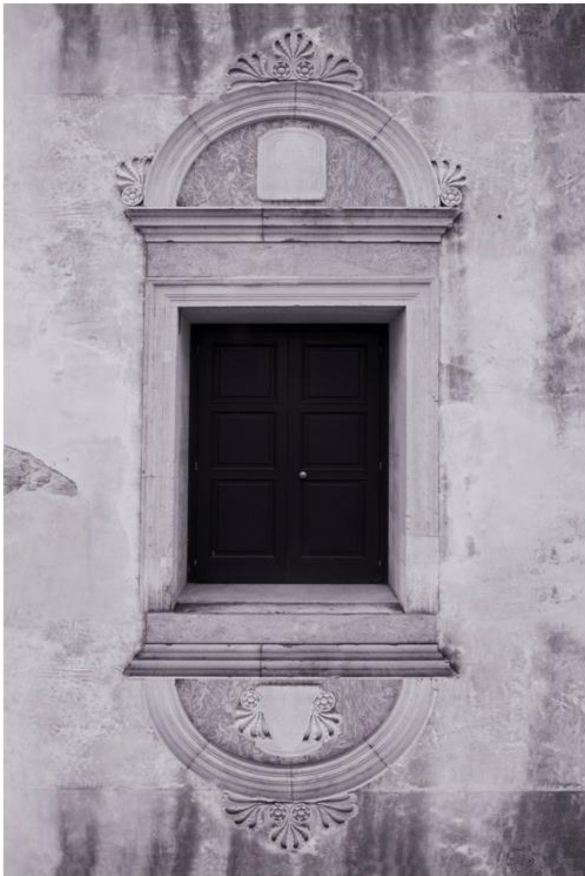
Figure 2: Door from Dolomites . Photographic installation, Dennis Del Favero, 2014. Courtesy of the artist.