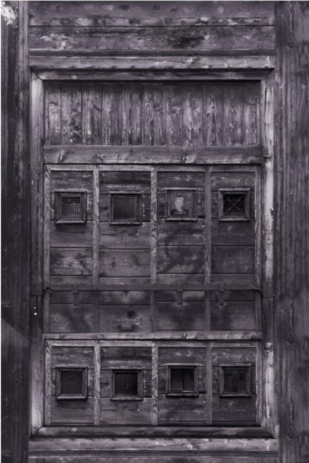
Figure 3: Door from Dolomites . Photographic installation, Dennis Del Favero, 2014. Courtesy of the artist.

It is as an example of a work that conveys something of the trauma of asylum-seeking affectively, rather than through the emotional appeal of a narrative, that Dennis Del Favero's Tampa 2001 offers a telling alternative to the obligation-based approach of Chasing Asylum . The work constitutes one segment in Del Favero's ongoing Firewall series, which "explores the concept of the 'door' as a metaphor for the dynamic interaction between the human and non-human worlds" (Del Favero, qtd. in "Libidinal" 10). An earlier work in the series,