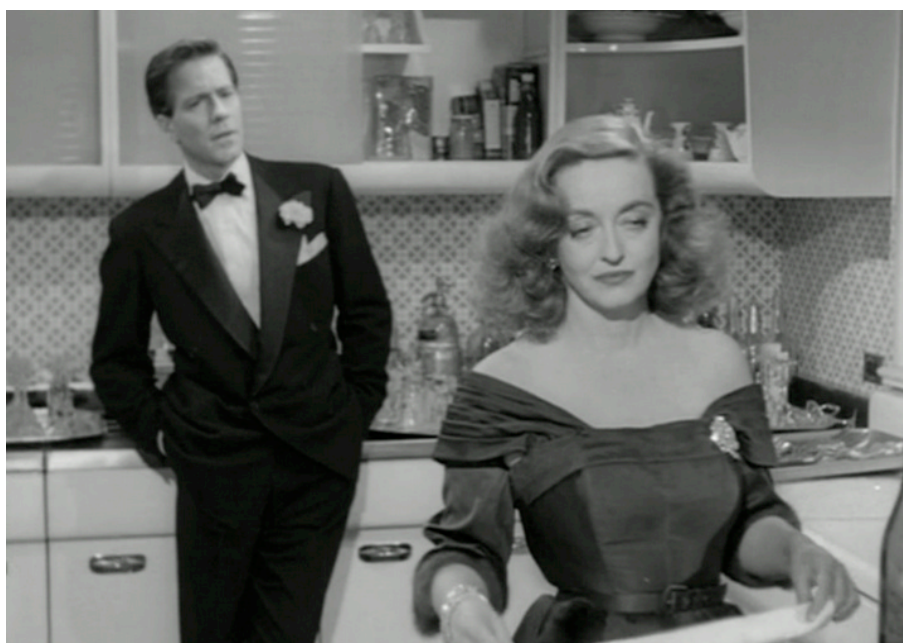
Figure 1 (above): Luminița Gheorghiu as the mother in Child’s Pose (Călin Peter Netzer, 2013). Parada Film, 2013. Figure 2 (below): Bette Davis as Margo Channing in All about Eve (Joseph L. Mankiewicz, 1950). Fox, 2012. Screenshots.