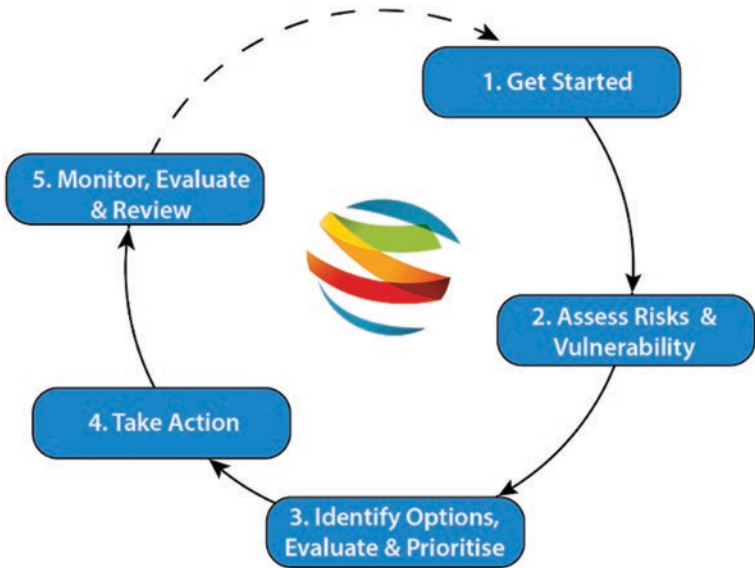
Fig. 7.2 CLIMATE project best practice adaptation planning model