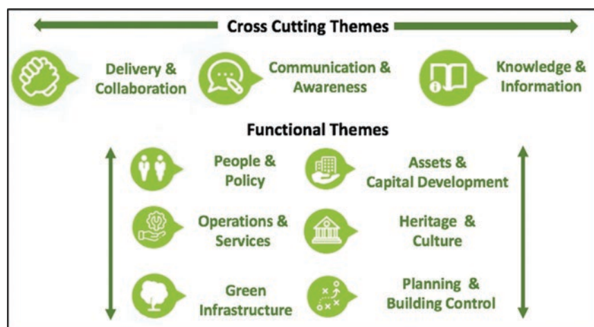
Fig. 7.3 Thematic priorities of the DCSDC climate adaptation plan (after DCSDC, 2020a)

DCSDC have committed to mainstream climate adaptation into policies and plans, and prepare Council staff for the effects of climate change through the cross-cutting themes of delivery and collaboration, communication and awareness, and knowledge and information (Fig. 7.3). This recognises that integrating and mainstreaming climate adaptation into policies is an effective mechanism to ensure resilience and preparedness. For example, the inclusion of climate adaptation considerations through a 'screening' of Council's existing and emerging policies will ensure that the future direction and procedures of services are resilient to climate