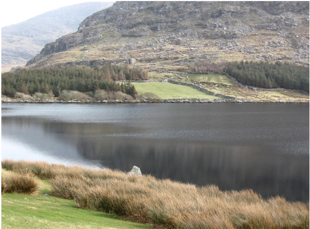
Fig 3. Coomasaharn cirque lake, showing conifer forest plantation and reclaimed green land in the background.

Currently, land abandonment is not a major issue in the valley, in fact parts of the mountain are still overgrazed. But, not only can abandoned land be observed at the entrance to the valley and throughout the Iveragh peninsula, there is a general consensus in the study area that it is what the local people refer to as a 'tipping point', and that the current generation of hill farmers will be the last to farm the mountain in the way they have traditionally done for generations, albeit with adaptations. One is frequently reminded that 'soon there will be no one here' and that the mountain 'will go wild', meaning out of human control, something that is always perceived in negative terms. What is happening in the Coomasaharn-Canearagh valley is typical of many other isolated places throughout the Iveragh and Irish uplands in general.