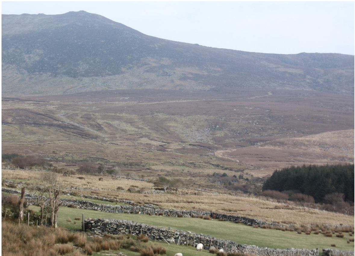
Fig 2. Coomasharn-Canearagh mountain valley with scree covered mountain and cut-over bog in the background, and rough grazing in the foreground.

Apart from the above-mentioned resident active farmers, there are four farmers from outside the valley who have bought and/or inherited land in the valley, mostly for access to commonage, and are locally referred to as 'people coming-in', and none of whom live in the valley. At the entrance to the valley, some cutover bog (with no commonage rights), was bought by outside investors some years ago, essentially for its entitlements/subsidies. This land is fenced off and abandoned. It is today covered in regenerating scrub, 'rewilding', and is seen as a potential fire risk. The area around Coomasaharn lake is particularly scenic (see Fig. 3). All the uplands in the study area are designated as Special Areas of Conservation (SAC), as defined under the European Habitats Directive (Directive 92/43, May 1992), in recognition of their internationally important blanket bog and moorland habitats. There are legally binding restrictions on development and land use within SAC areas.