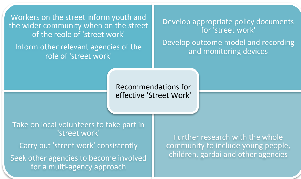
Figure 3: Recommendations for Southill Outreach for an improved service for the communities of the south side of Limerick