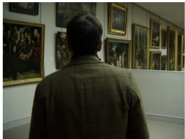
Figures 3 and 4: Aesthetics and erotics of entanglement. Leçons de ténèbres . Screenshots.