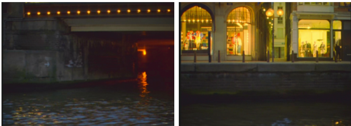
Figures 1 and 2: Cruising the cavities of the city. Leçons de ténèbres . Optimale, 1999. Screenshots.

Given Dieutre's choice description of the filmmaking process in quasi-collagistic terms—he speaks of collating and reconfiguring material fragments which have been "deliberately torn from the real" ("Abécédaire"), and his further comment that this reorganisation of "images and sounds" serves an aleatory function (creating an open-ended "initiatory journey" ("UniversCiné"))—I want to trace the dialectics of word and image, and presence and absence in Leçons de ténèbres to explore how they suggestively contour the film's exploration of gay sexuality, queer space and time. I draw attention here to two instances of ekphrastic narration in the film, the first of which relates to the film's urban vernacular register, its investment in the spaces of the everyday, and the second which starts to engage the film's artistic frame.