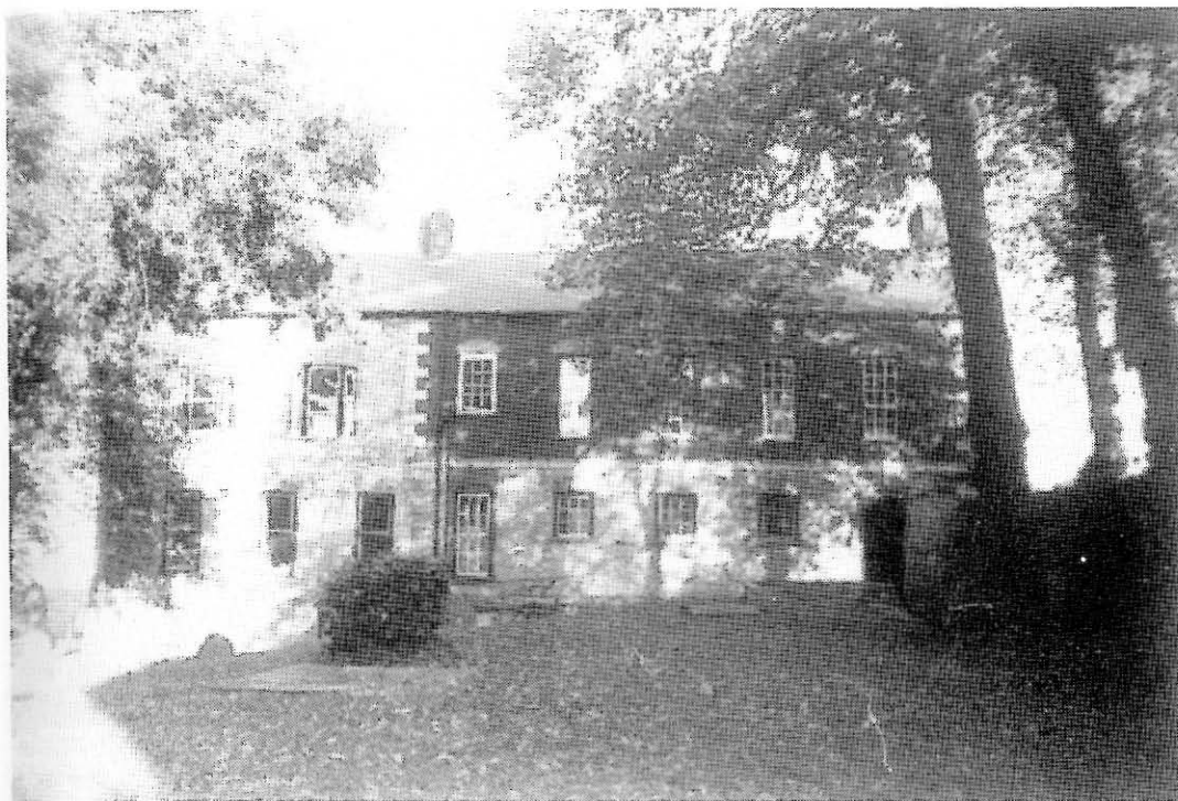
OLD LIBRARY, AT ST FIN BARRE'S