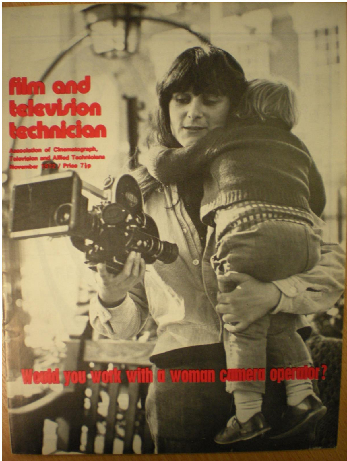
Figure 1: Front cover of Film and Television Technician (November 1972) featuring a female camera operator holding a camera in one hand and a small child in the other, with the caption “Would you work with a female camera operator?”

The issue featured three articles on gender discrimination in the film and television industries, including an article by Women in Media—a campaign group established in 1970 by women in