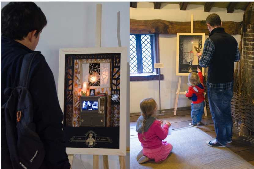
Figure 14: The Interactive Tableaux at the Bishops' House Museum. Each tableau reacted with different behaviours when activated with replica objects.