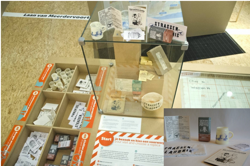
Figure 13: The smart replica objects for The Hague and the Atlantic Wall at Museon (inset). Each replica reproduced an authentic object in the exhibition (inside glass case in photo). Replicas of each object could be picked up by visitors (left of exhibition stand in photo) to explore the exhibition and trigger virtual content representing different points of view.