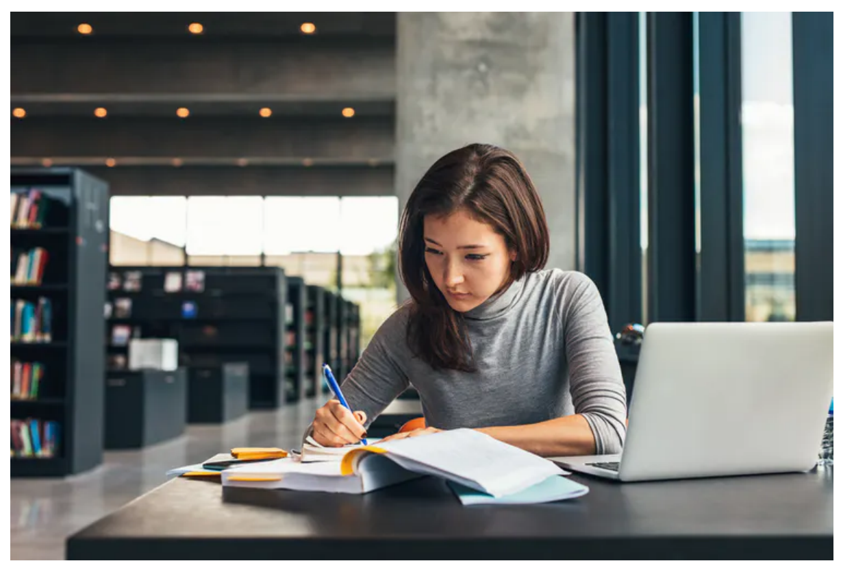
Research found that study habits were a better predictor of success than resilience.

Yet, for all their power, ideas like grit and resilience can be controversial. Research shows that resilience and grit is not the only – or even the best – route to success. For academic success, other factors such as attendance and study habits are much better predictors of success than grit or resilience.