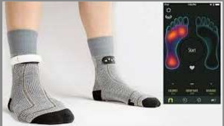
Figure 5 - Sensoria-socks

Likewise, Sensoria partnered with the Michael J. Fox Foundation and Neuroscience Research Australia to launch a clinical trial for investigating how Sensoria smart textiles socks can improve care for Parkinson's disease by collecting data and by testing a haptic feedback that can prevent "freezing of gait" events in patients. 17, 18