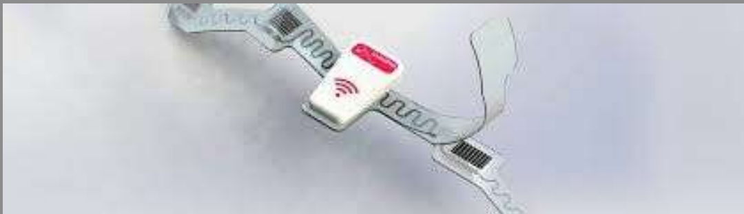
Figure 6 – Ulimpia bandage

In the ULIMPIA project, sensor yarns are integrated into a textile carrier material. When processed into a plaster, they can record the temperature, pH and moisture of a wound and transmit them wirelessly. The continuous sensor-based wound monitoring can give an early indication of potential complications, particularly with chronic wounds.