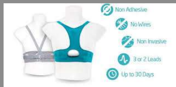
Figure 3 - NUUBO wearable ECG unit