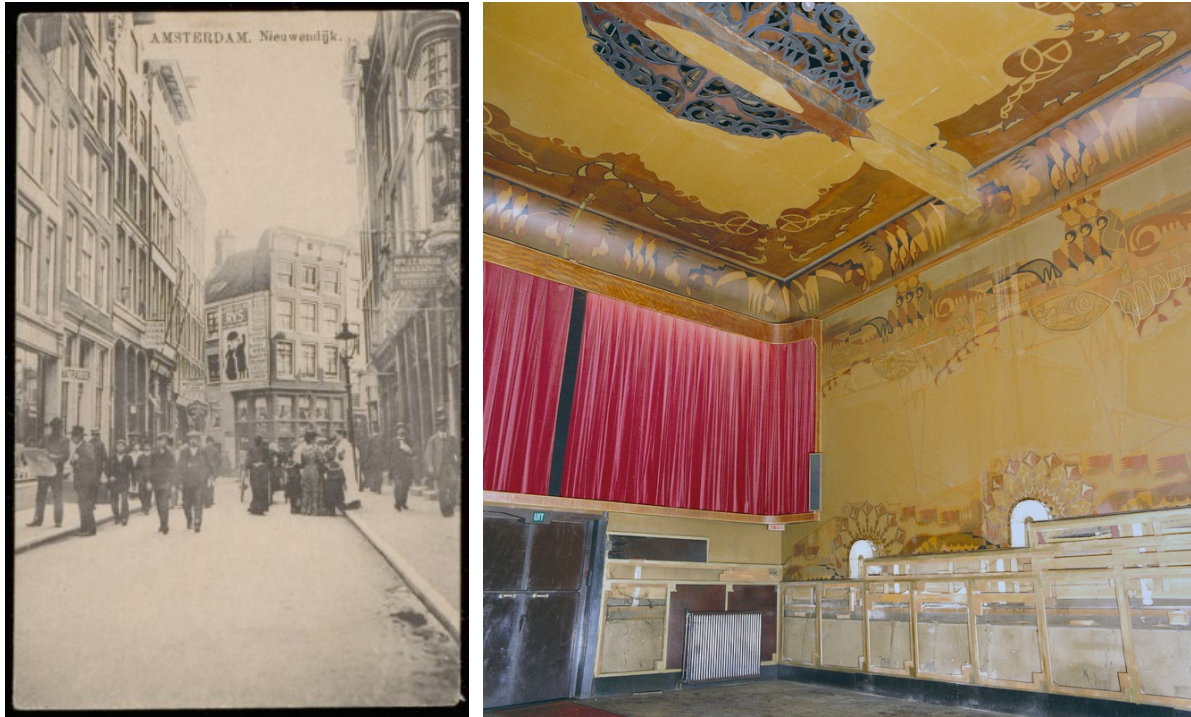
Figure 4 (left): Nieuwendijk 65–75, Amsterdam around 1910. Postcard from the Amsterdam City Archives photo collection. Figure 5 (right): Cinema Parisien’s 1924 art deco interior, before the move to the Filmmuseum at Vondelpark in 1987. Photo: Paul van Galen. Source: Cultural Heritage Agency of the Netherlands photo collection. Licence CC.BY-SA 4.0.

where it can presently be viewed. In these different forms, then, Cinema Parisien has been a part of Amsterdam cinema culture for the past one hundred and five years.