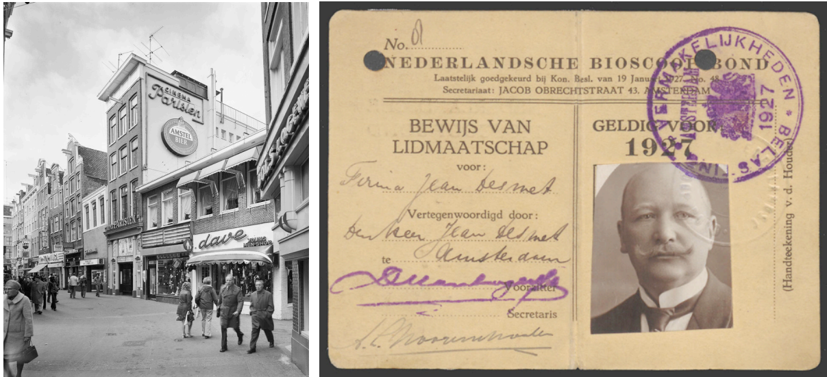
Figure 1 (left): Cinema Parisien at Nieuwendijk 69, Amsterdam in 1976. Photograph Paul van Galen 1976. Source: Cultural Heritage Agency of the Netherlands photo collection. Licence CC.BY-SA 4.0. Figure 2 (right): Jean Desmet's membership card of the Dutch Cinema Federation. Public Domain.

In this article we evaluate the relevance of 3D visualisation as a research tool for the history of cinemagoing. How does the process of building 3D models of cinema theatres relates to what we already know about this history? In which ways does the modelling process allow for the synthesis of different types of archived cinema heritage assets? To what extent does this presentation of “content in context” helps us to better understand the history of film consumption? We will address these questions via a discussion of a specific case study, our visualisation of Desmet's Cinema Parisien in Amsterdam. The choice of this case study was motivated by its historical importance as one of the first permanent cinema theatres in Amsterdam with a long, rich history that is extensively documented. First, we will reflect on 3D visualisation as a research tool, outlining its technology and methodological principles and its usefulness for research into the historiography of cinemagoing. Subsequently, we will describe our 3D visualisation of Cinema Parisien, discussing the process of researching and building the model. Finally, we will evaluate the results against the existing body of knowledge on the history of cinemagoing in Amsterdam, and of this cinema theatre in particular, and answer the question to what extent 3D visualisation as a research tool can aid our understanding of the history of cinema consumption.