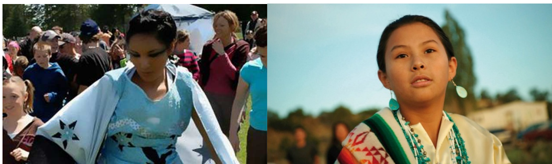
Figure 5: Hi-Ho Mistahey (Alanis Obomsawin, 2013). National Film Board of Canada. Screenshot.