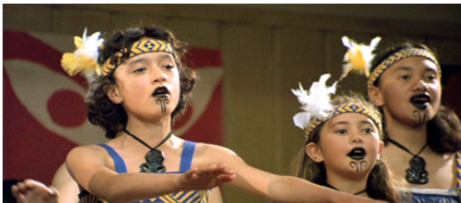
Figure 3: Lilo & Stitch (Dean deBlois and Chris Sanders, 2002). [Walt Disney Pictures]. Screenshot.